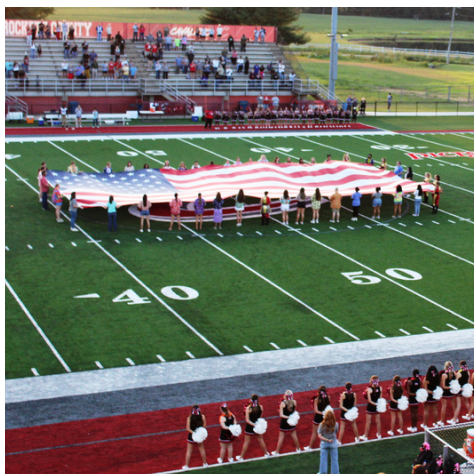
Above: Before the game, students unfurled an enormous flag donated to the high school by the Woodmen of the World insurance firm.