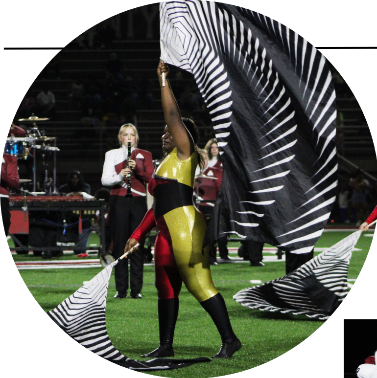
Above: Crockett's Marching Cavaliers Band put on some razzle-dazzle at halftime.