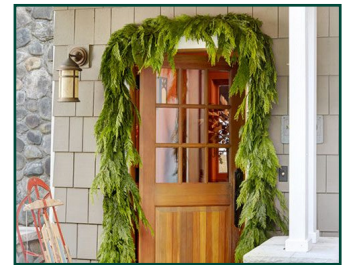
10' Western Cedar Garland Price: $28