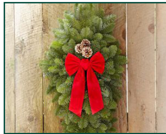
Noble Fir Door Swag 30" x 19" Price: $26