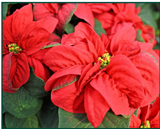
8" Pot Red or White, 15-20 Blooms 23"-27" Spread Price: $22

Pick-up will be the week of November 27th. Please provide a cell phone and email for the person responsible for picking up items.