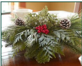
Holiday Centerpiece Price: $20