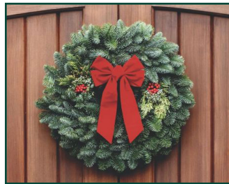
Mixed Evergreen Wreath (22" or 28" Mixed) Price: $28 or $38