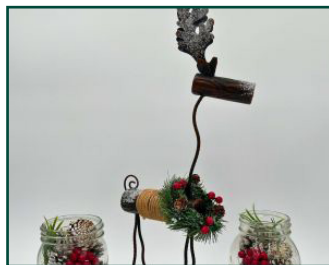
19" Snowy Reindeer Price: $24