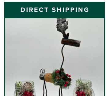
19" Snowy Reindeer Price: $35