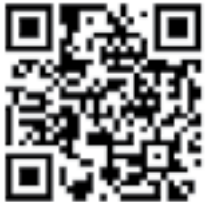
Pearland ISD Website