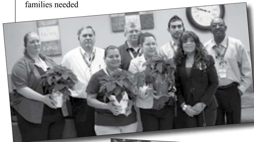
Above: Employees from Wal-Mart - Dixie Farm Road

In addition, Favors for Friends Charity Thrift Store donated $2,400 in toys and gift cards for four families.