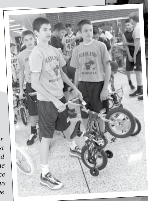
Pearland Junior High East athletes donated 27 bikes for the Pearland Police Department's Toys for Tots drive.