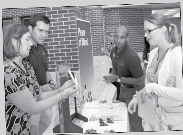
Gulf Coast Educators Federal Credit Union employees greet new teachers during a welcome luncheon.

Pearland ISD thanks the following community partners for their generous support. These partners help create the best learning environment possible through in-kind donations, financial support and student/staff incentives.