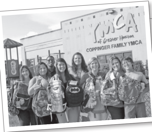
YMCA Operation Backpack donated filled backpacks for the ninth consecutive year.