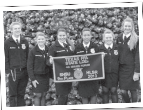
Pearland FFA Agricultural Issues Team

The Pearland FFA Agricultural Issues Team placed ninth in the state at the FFA Leadership Development Events contest in December. Statewide, 168 teams competed in this category this year. Teammates included