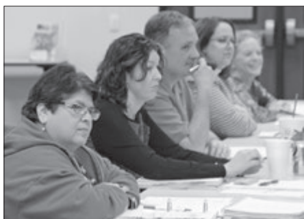
The education foundation board of directors meets Jan. 15 to discuss the founders' drive.

Not only will donors have the opportunity to partner with a district that has a track record of academic excellence, but they will also expand learning opportunities to prepare students for college