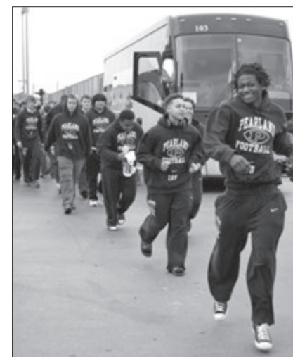
The Pearland Oilers football team heads to the state championship game.