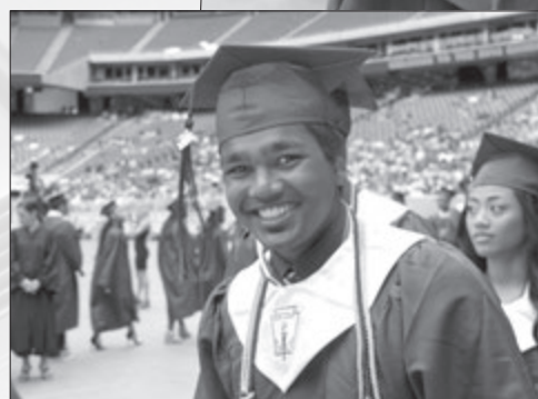
Dawson High School graduates