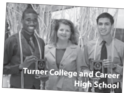
Turner College and Career High School

Students with academic grit took the spotlight during the board of trustees' annual All-A Banquet this May.