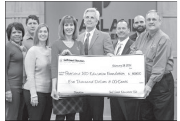
Gulf Coast Educators Federal Credit Union gave the inaugural donation to the Pearland ISD Education Foundation.