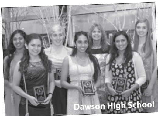
Dawson High School