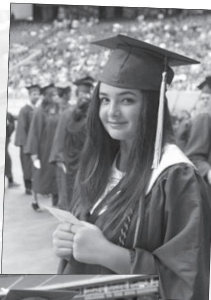
Pearland High School graduate

For the first time ever, Pearland ISD celebrated three graduating classes at once. Turner College and Career High School seniors tossed their mortarboards at their campus, while students from Dawson and Pearland high schools accepted their diplomas during back-to-back ceremonies at Reliant Stadium.