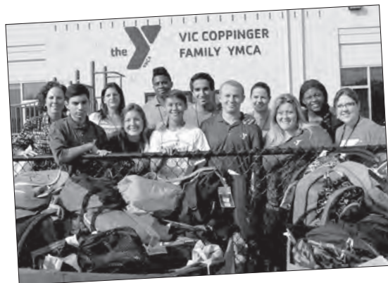
10th Annual YMCA Operation Backpack

During YMCA Operation Backpack, Vic Coppinger Family YMCA