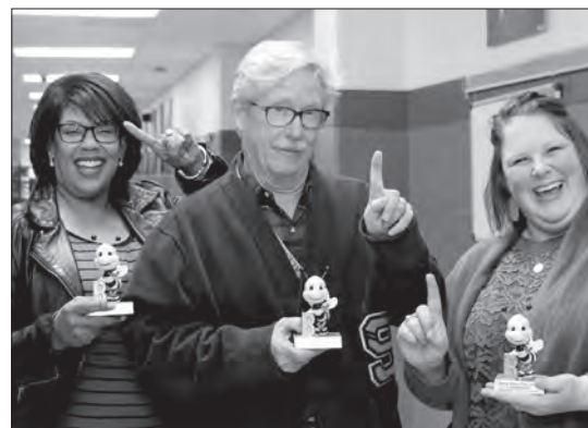
"Modified Spellers," championship team