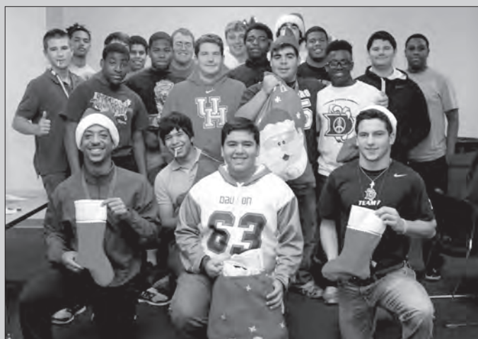
Left: Dawson Eagles football players stuff stockings with treats.