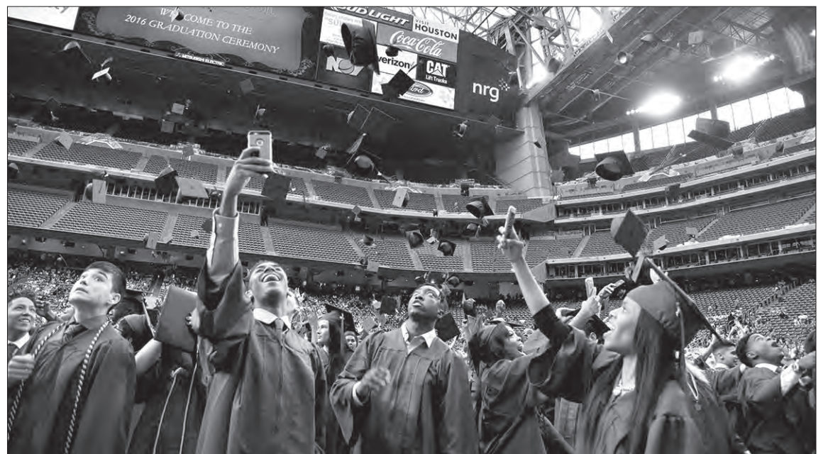
Clockwise, from top left: A Turner College and Career High School student beams after walking off the stage with her diploma. / Pearland High School students show off proof of their graduation. / Dawson High School students capture the graduation-caps-in-the-air moment with their cell phones.

Want to see more graduation photos? Check out the district's graduation photo albums at www.flickr.com/photos/pearlandisd/albums .