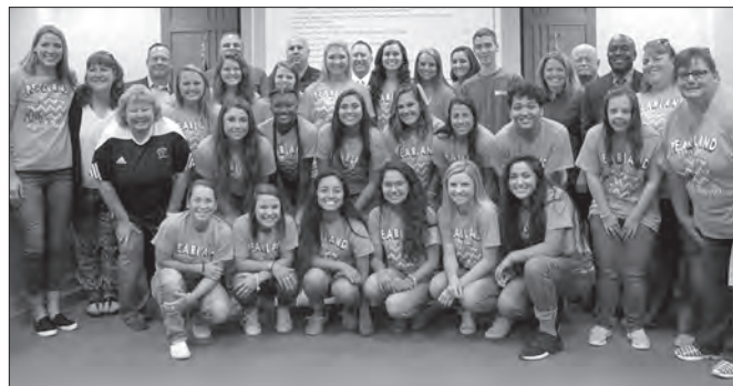
Left: In May, the Pearland Lady Oilers Softball Team captured the 6A Region III Championship to advance to the 2016 UIL state softball tournament. The team's playoff journey included beating No. 1 state-ranked Deer Park and defending state champion Katy. Ultimately, the Lady Oilers beat Weslaco in the semifinal game to advance to the finals, where the team placed as state runner-up and 2016 6A State Softball silver medalists.