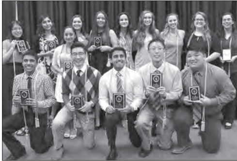
Four-year all-A seniors from Dawson, Pearland and Turner College and Career high schools