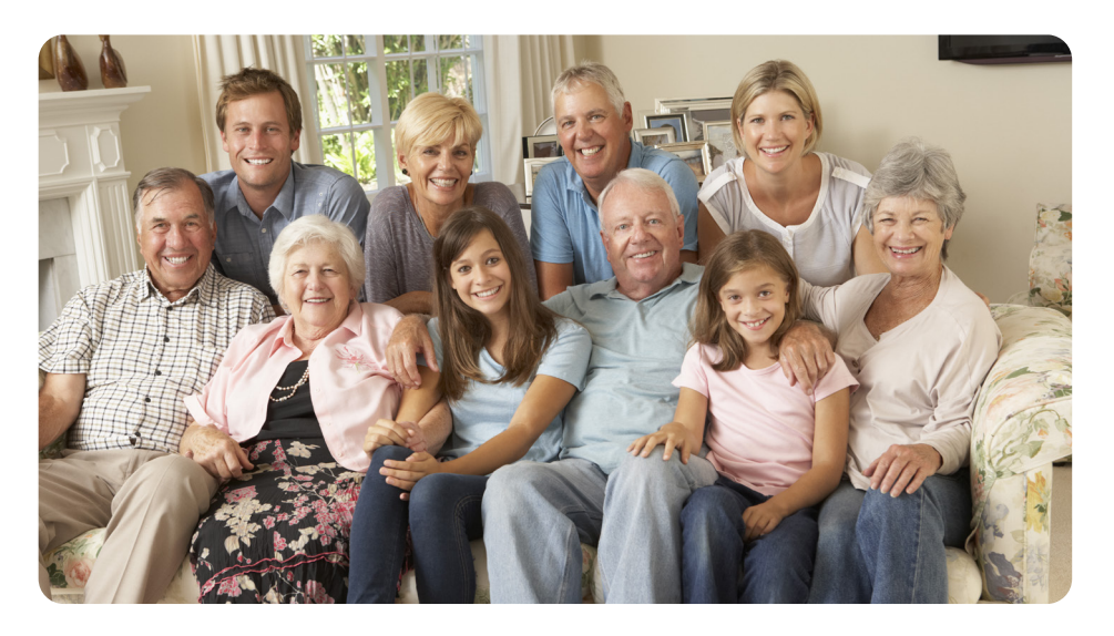
Families are all different sizes. Aunties, uncles, cousins and grandparents are family members.