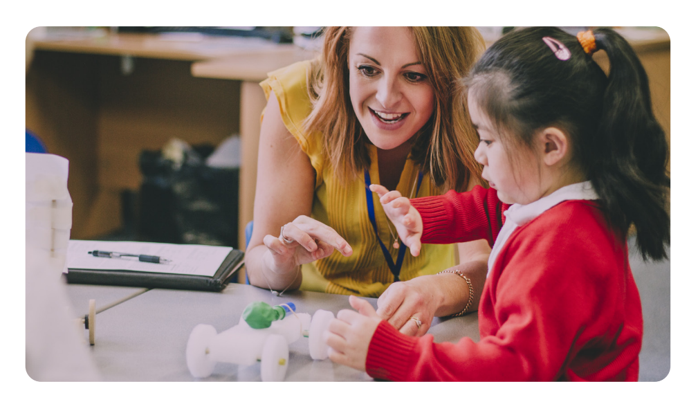
In the local community there are lots of people who can help us. Including teachers, shop workers, doctors and the emergency services.