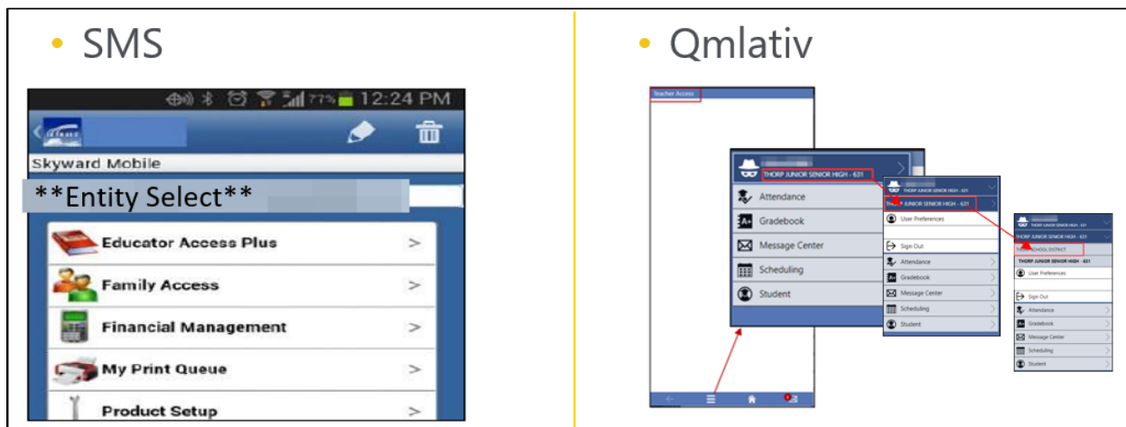
Mobile Access app display differences.