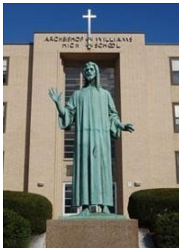
Christ the Teacher

Archbishop Williams High School reached another milestone in 2014-2015 when it opened its Grade 7 & 8 Program.