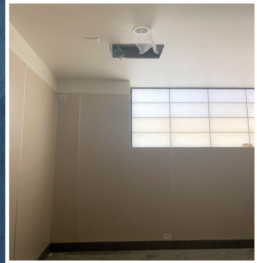
Building B –FRP Started in Bathrooms