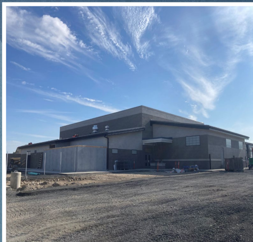
Southwest Exterior Overall