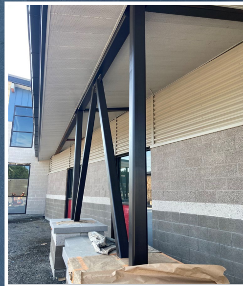
Exterior Steel Column