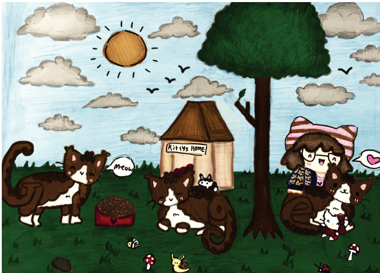
Google Doodle Illustration by Caroline Piszczatowski