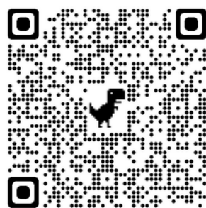
Students with Cars