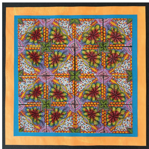
KEIRA RHODES, GRADE 7