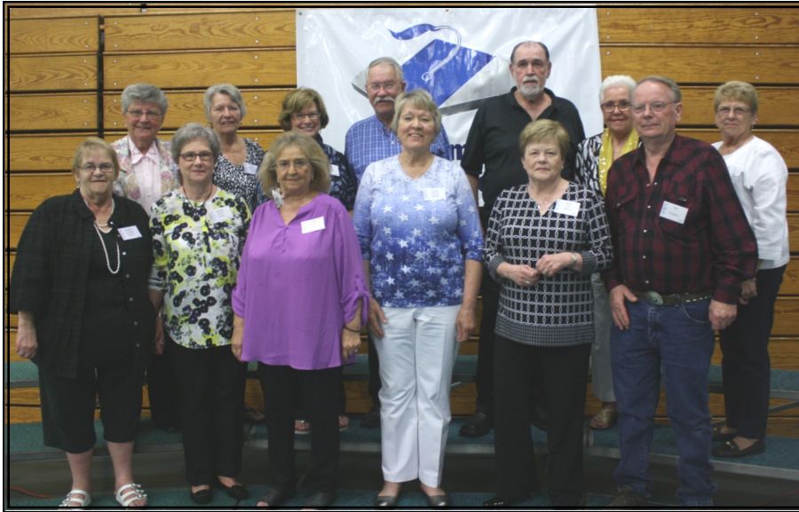
55 YEARS— CLASS OF 1961