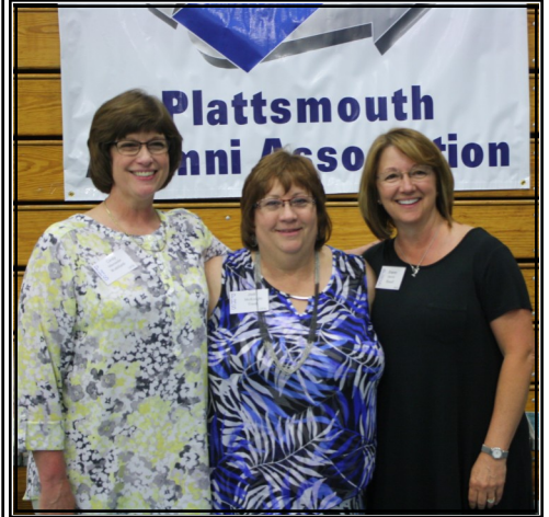
40 YEARS—CLASS OF 1976