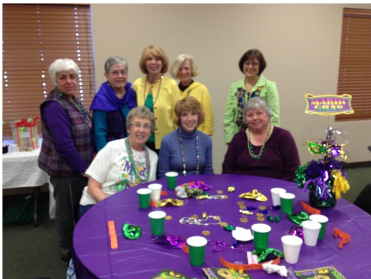
Table Theme: Mardi Gras