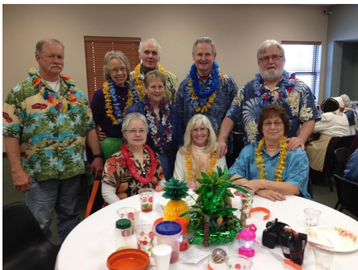
Table Theme: Hawaiian Sunset