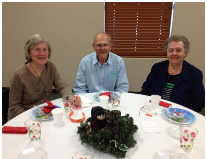
Table Theme: Snowman