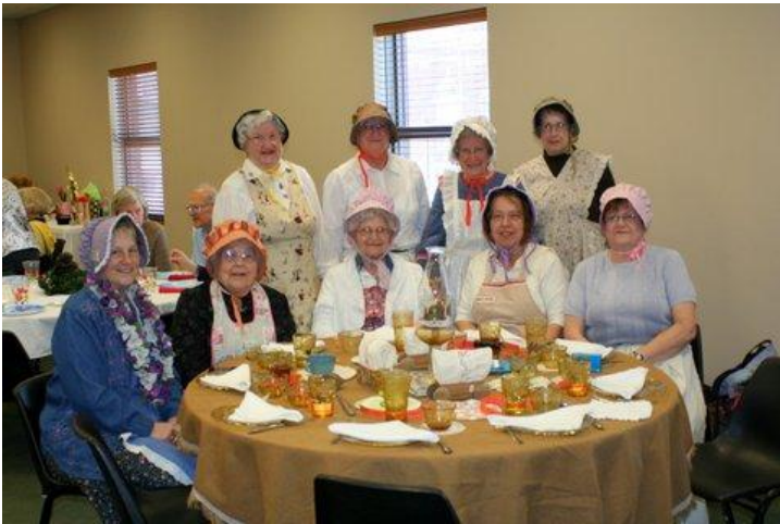
Table Theme: Women of the Nebraska Prairie