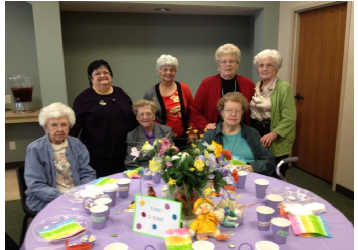
Table Theme: Think Spring