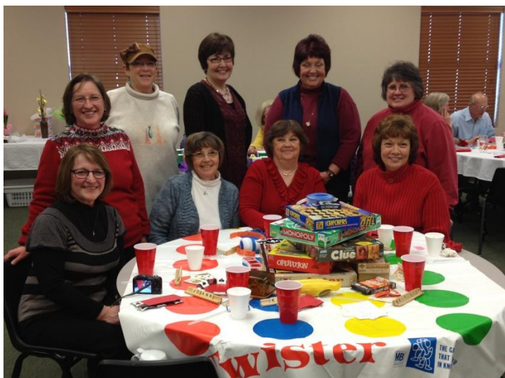
Table Theme: Game Night