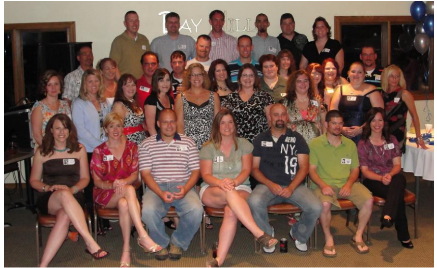
CLASS OF 1991 – 20 YEAR REUNION