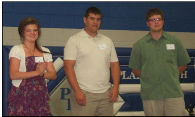
Plattsmouth Alumni Scholarship Winners 2011