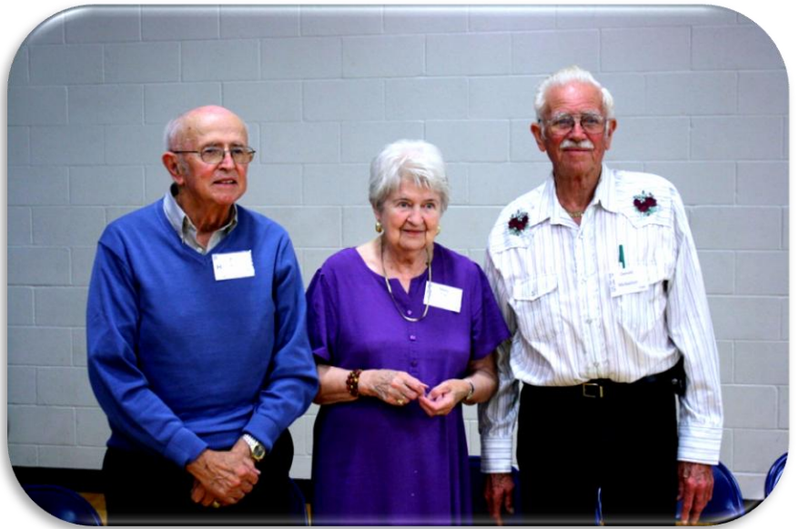
Class of 1948 – 65 years