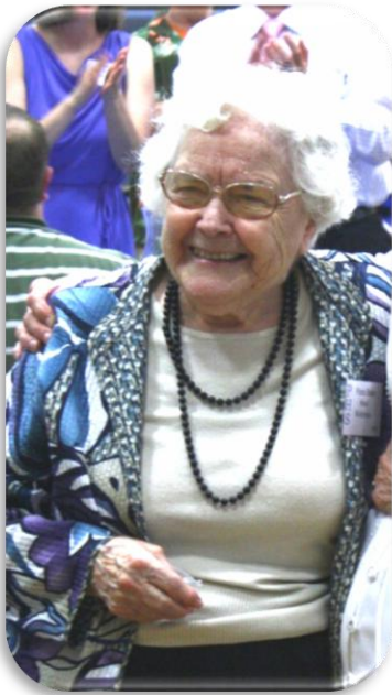
Class of 1938 – 75 years