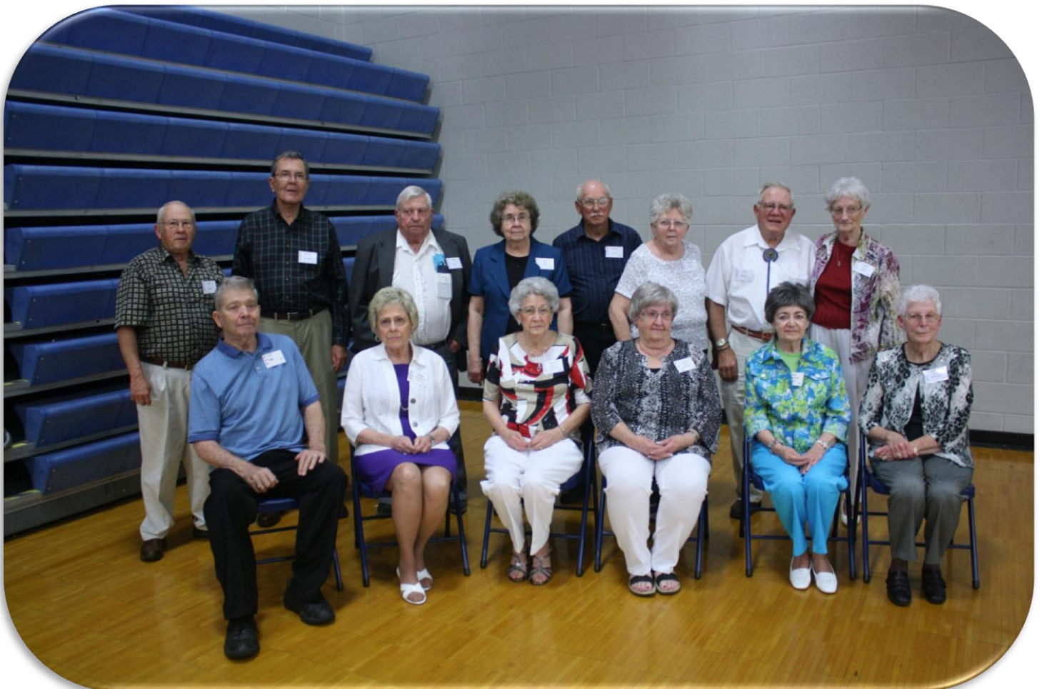
Class of 1953 – 60 years