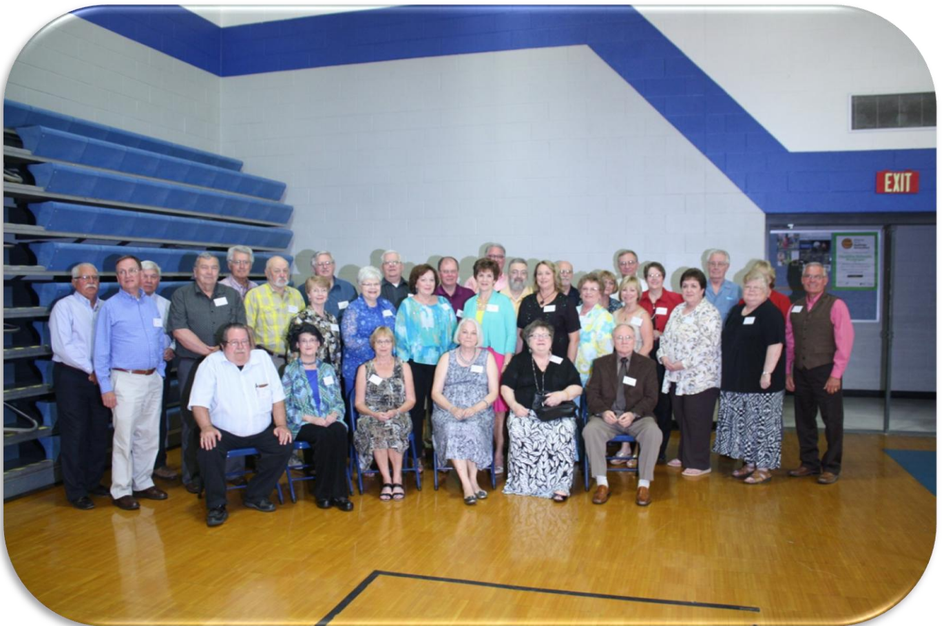
Class of 1963 – 50 years