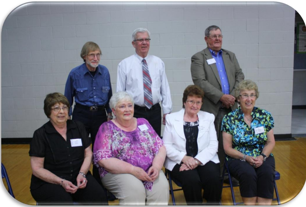
Class of 1958 – 55 years