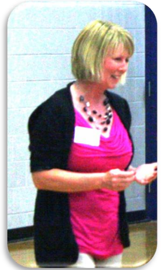
Class of 1988 – 25 years