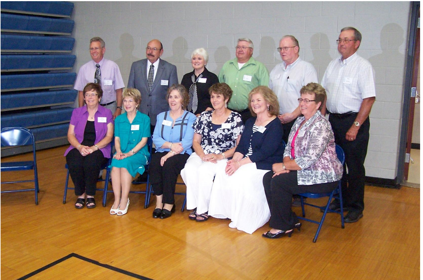
Class of 1962