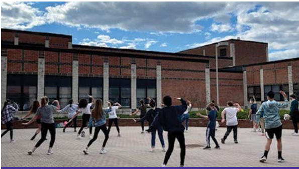
MS Students prepare for spring theatre productions