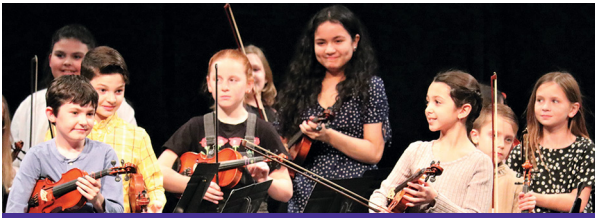
Gordon Creek Elementary School Orchestra students enjoying the applause at Winter Concert