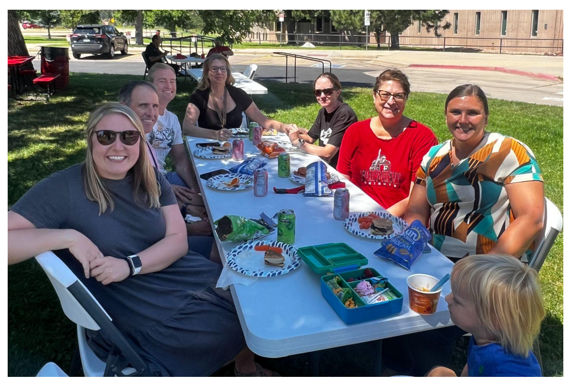
Featured here, Fairview High School Special Education Team

In Fairview High School we are dedicated to supporting every student so they ultimately become successful adults, who are engaged in our community. We begin with differentiating instruction for every student and then work with students and parents to provide additional accommodations, modifications and services for those who need it.