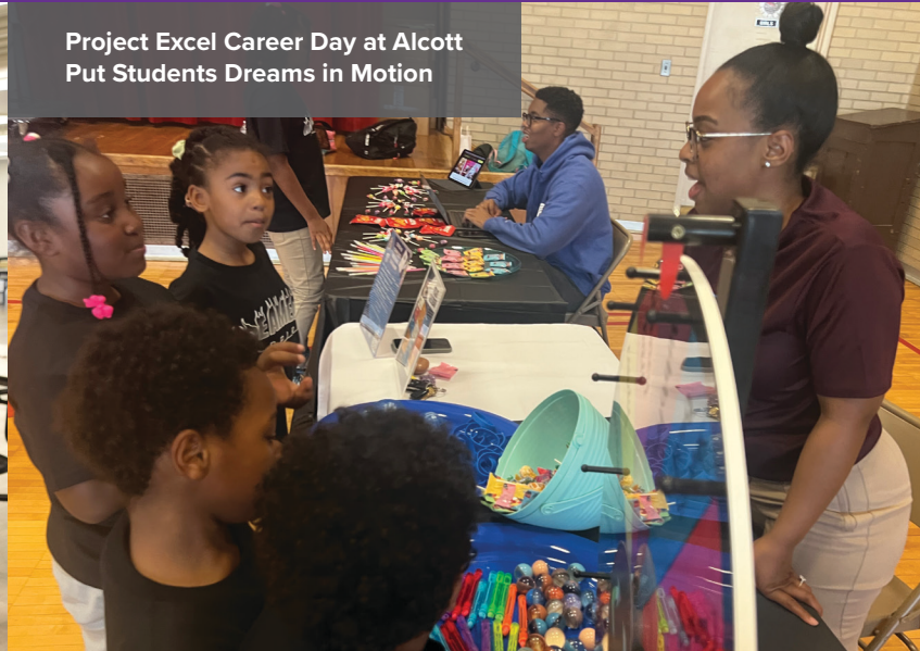
Project Excel Career Day at Alcott Put Students Dreams in Motion