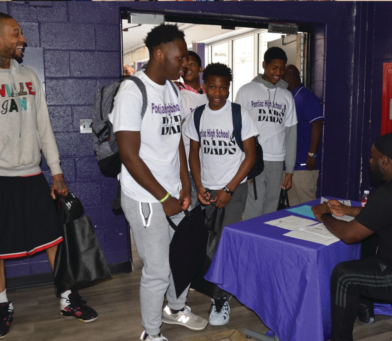
The First PHS DADS Event Showcased Positive Male Influences and Opportunities for Our Young Men