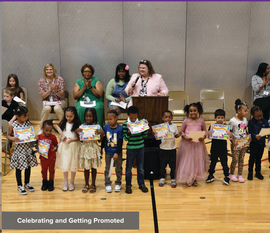
Celebrating and Getting Promoted