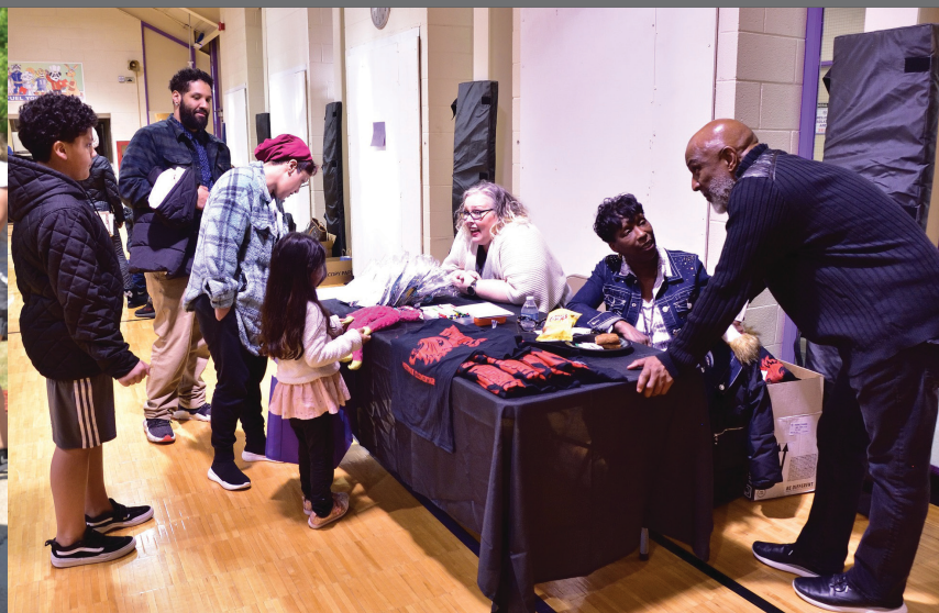
Kindergarten Round Up Celebrated Our Newest Class of Phoenixes