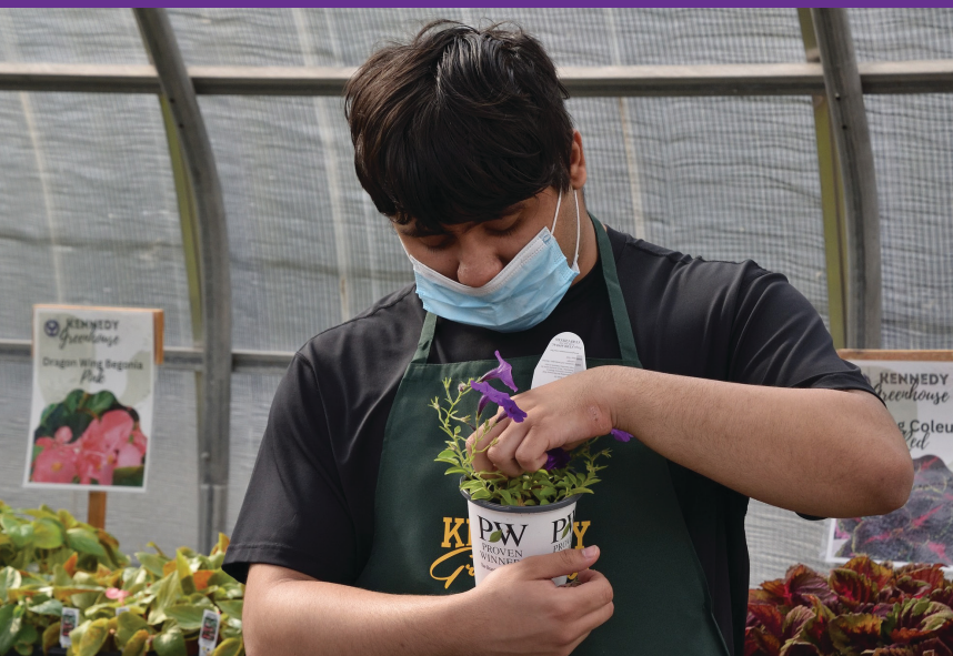
The Kennedy Greenhouse Welcomed Spring With a Burst of Beauty!