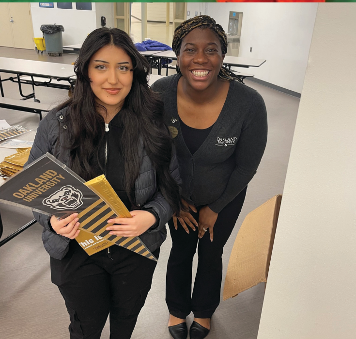
Decision Day Sent Our Students Off to Their Next Adventures