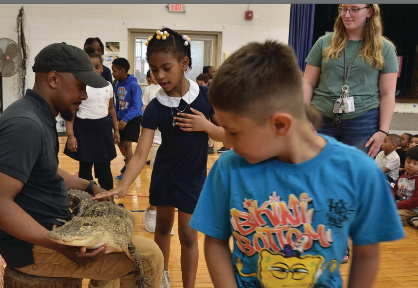
Things Got Wild at the Exotic Zoo