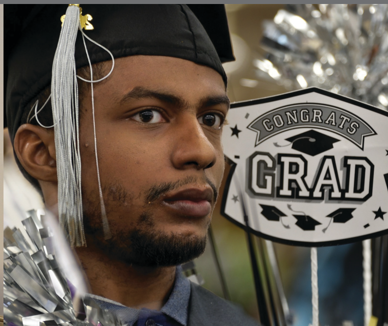
Our Kennedy Graduates are Ready for the World