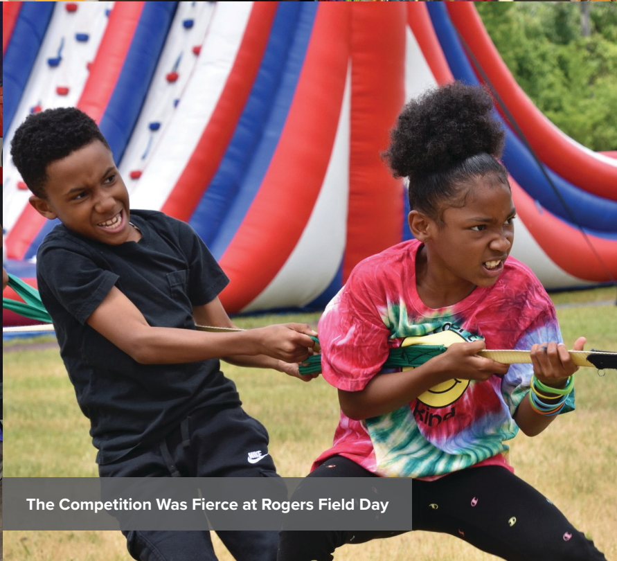
The Competition Was Fierce at Rogers Field Day