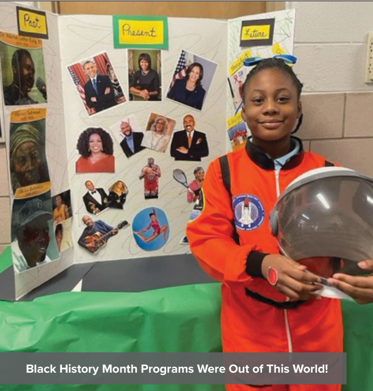
Black History Month Programs Were Out of This World!