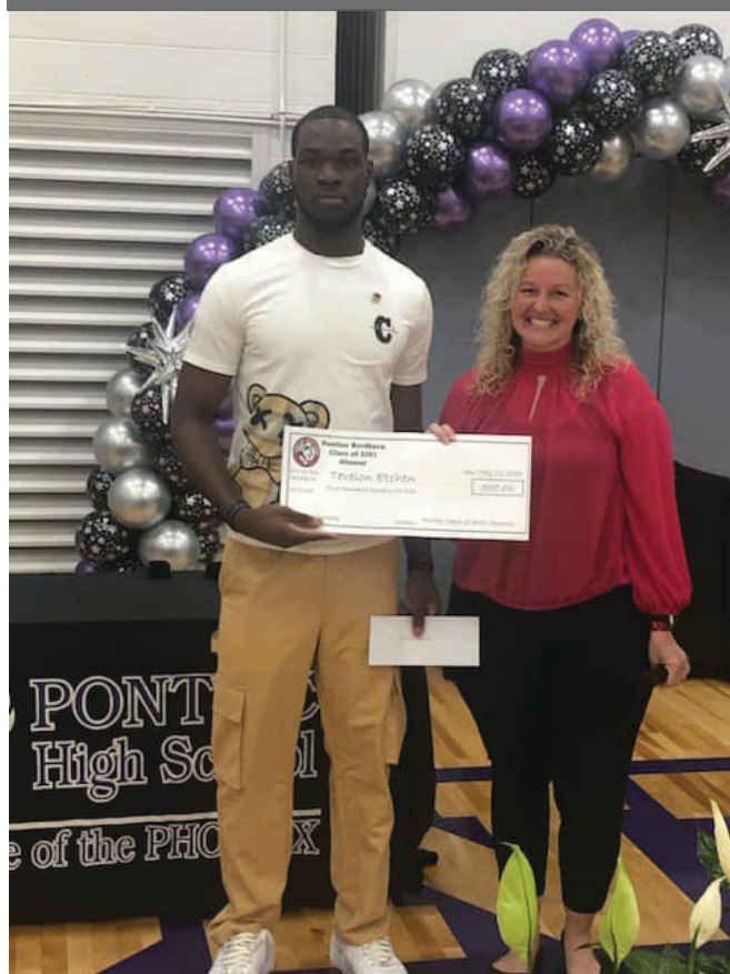
The PHS Pinning Ceremony Celebrated Our Senior's Achievements