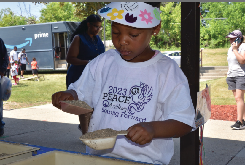
Our Littlest Phoenixes Are Soaring Forward to Elementary School