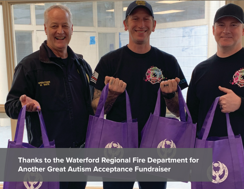
Thanks to the Waterford Regional Fire Department for Another Great Autism Acceptance Fundraiser