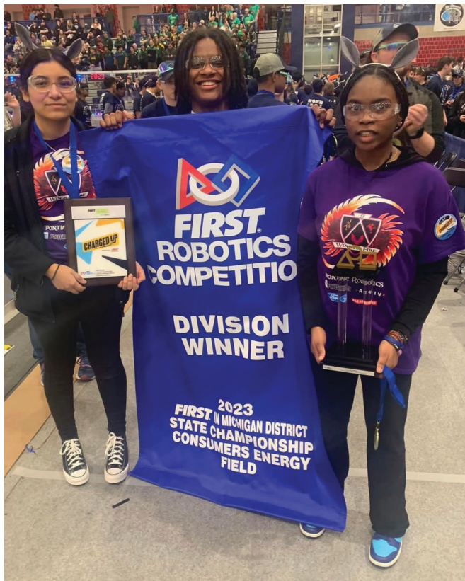
Wings of Fire Went on to Win 2nd in the State