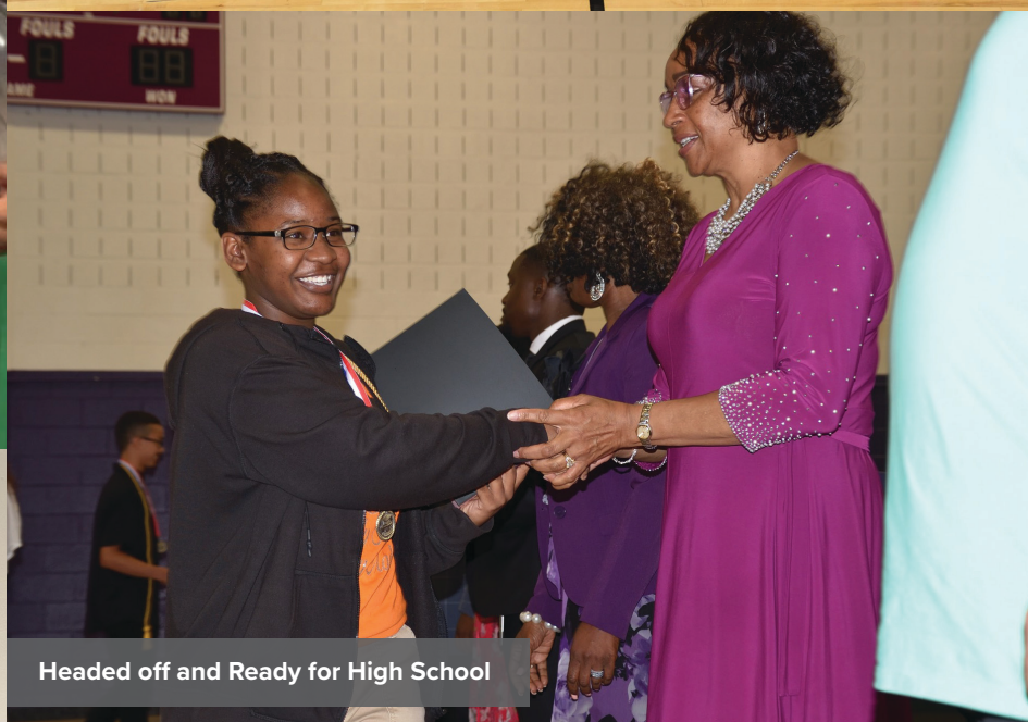
Headed off and Ready for High School