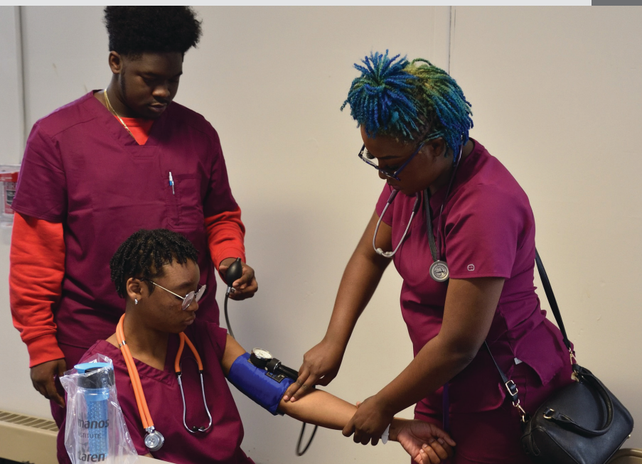
PCT & CNA Students Check Vitals at Our Career Pathways Expo