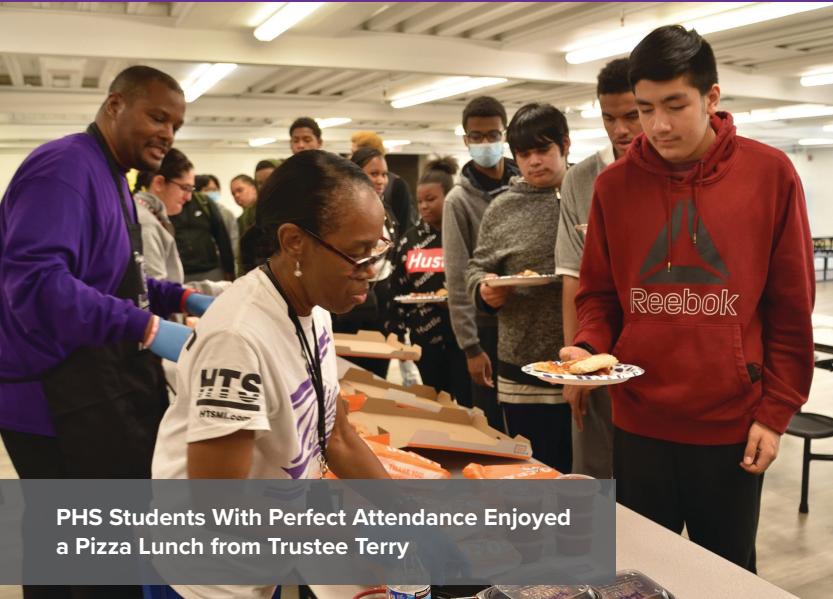
PHS Students With Perfect Attendance Enjoyed a Pizza Lunch from Trustee Terry