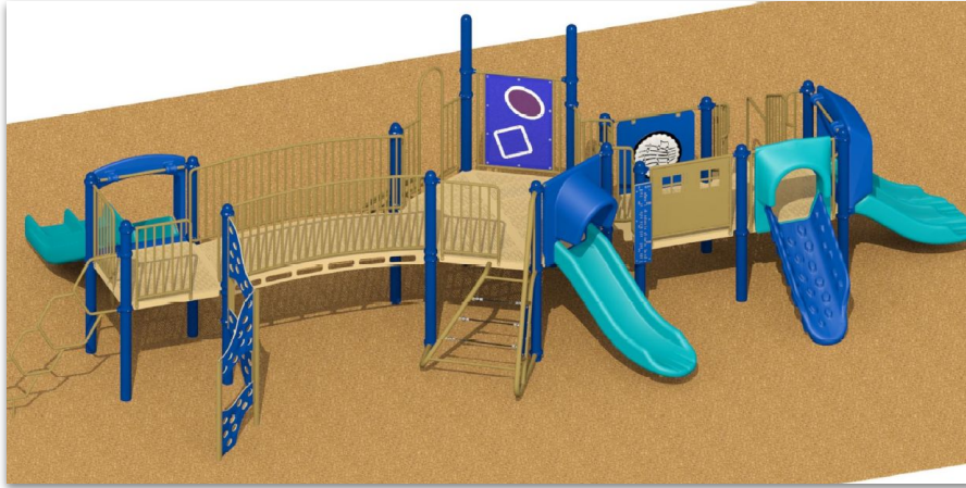
Mitchell Play Structure