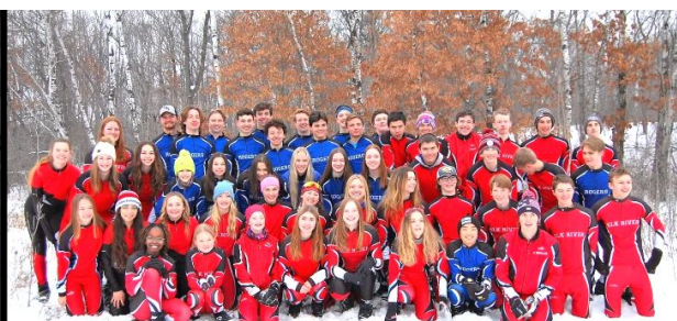
The Nordic Ski Boys Relay team are Section Champs and headed to State, along with one individual pursuit skier!