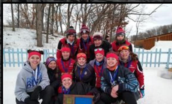
CONGRATULATIONS to the 2021-2022 Girls Nordic Ski team on their Section Championship and State Berth!