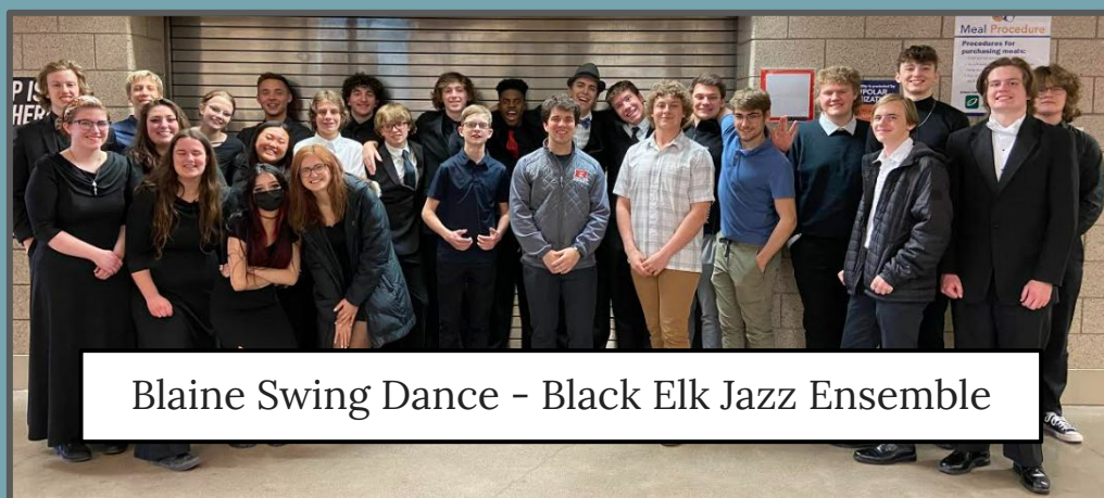
Blaine Swing Dance - Black Elk Jazz Ensemble