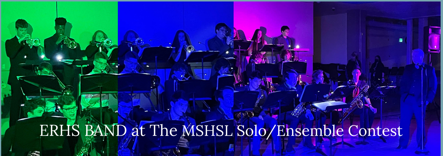
ERHS BAND at The MSHSL Solo/Ensemble Contest

Last week we hosted another MSHSL Large Group Contest where the concert band received a Superior rating. Great Job ERHS BAND!