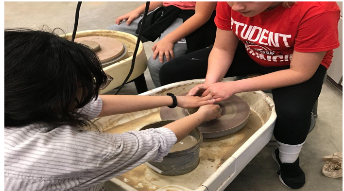
High School students in the clay class were giving Learn-the-Wheel opportunities.