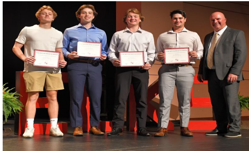
Elk River Boys Lacrosse

219 Scholarship awards to the class of 2023! 150 Total students - Total $200,150.00