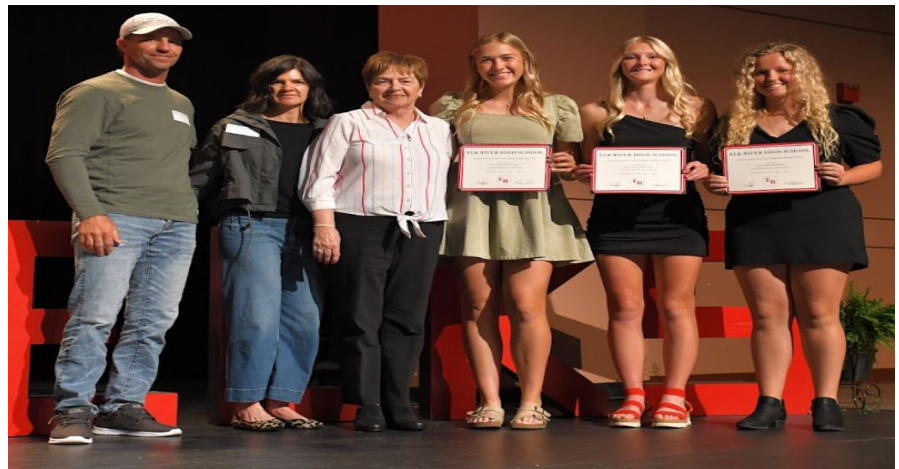
Great River Energy