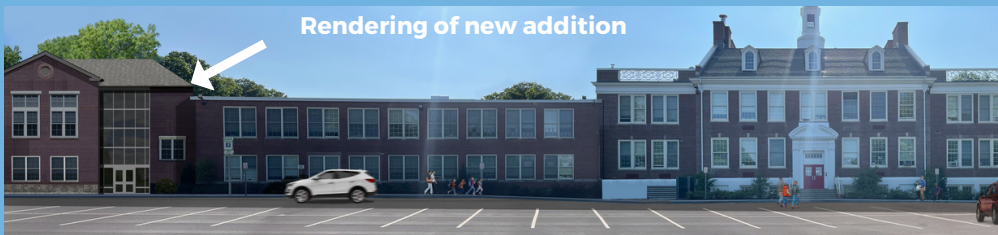
Rendering of new addition