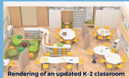
Rendering of an updated K-2 classroom