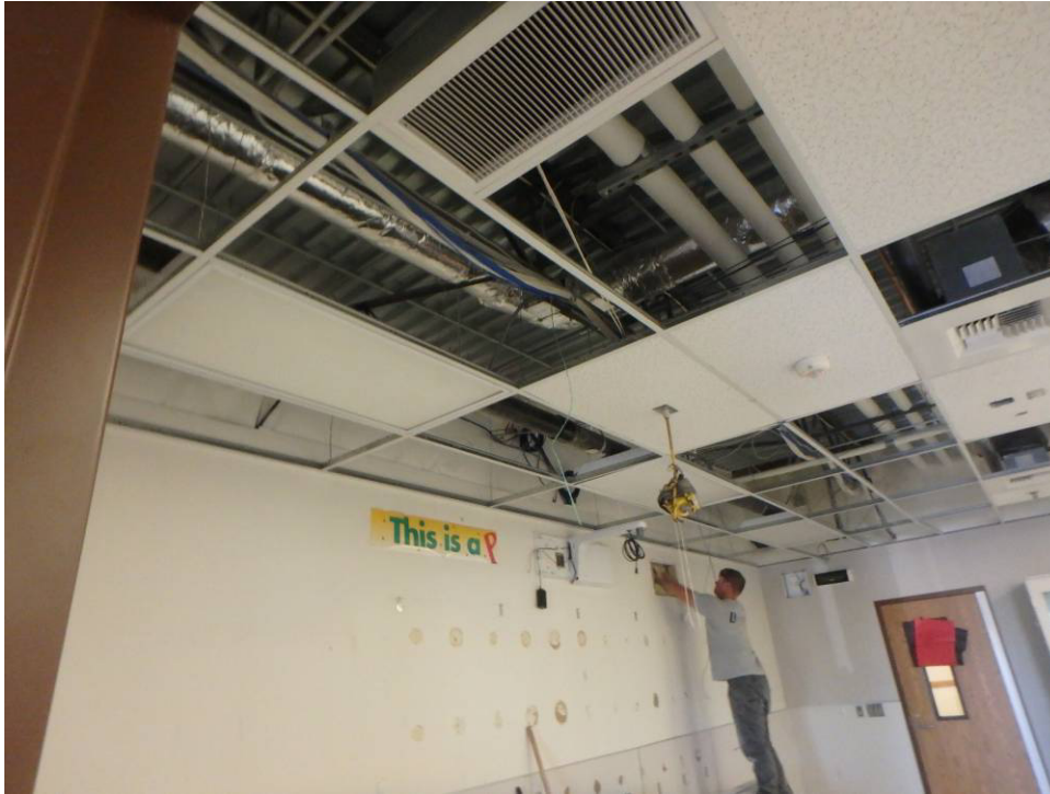
Alt. 1 main room north wall