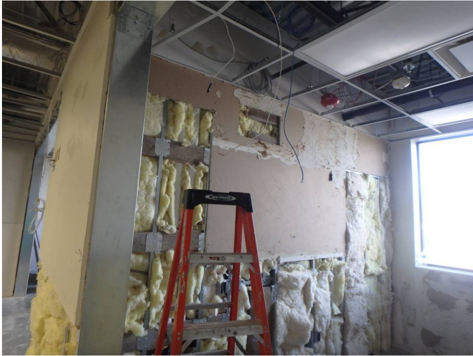
Alt 1 Looking at the south wall of the small exam room