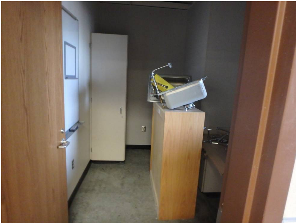
Alt. 1 Storage room