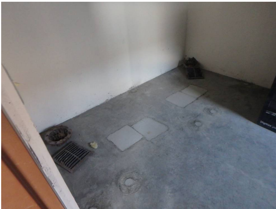
Alt. 1 Old kennel room infilled floor sinks