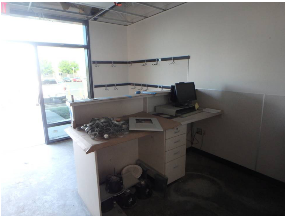
Old entry desk