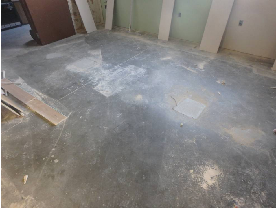
Alt. 1 Old exam room floor sinks infilled.