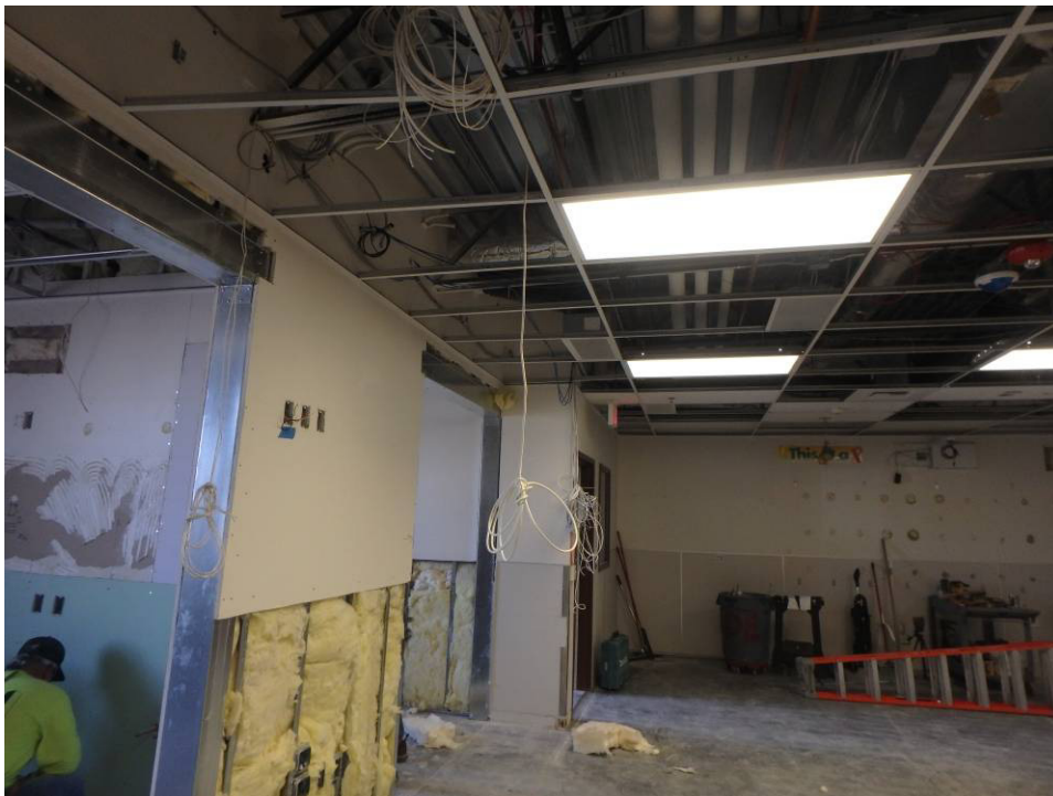
Alt. 1 main room west wall, looking north