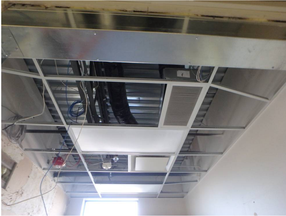
Alt 1 Looking at the ceiling of the small exam room