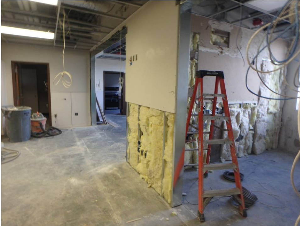
Alt. 1 main room west wall