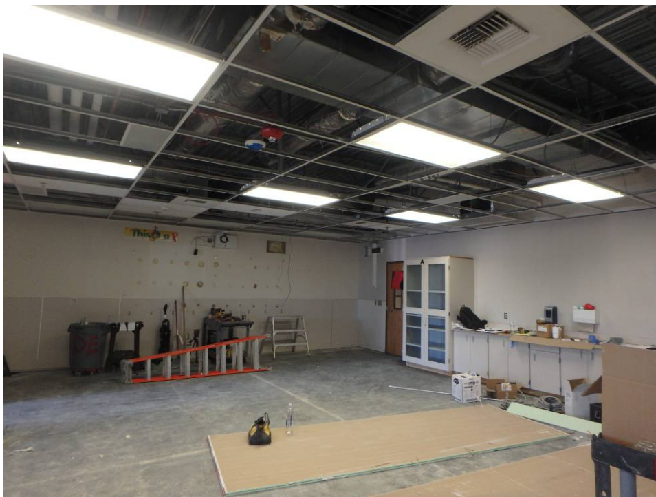
Alt. 1 main room northeast corner