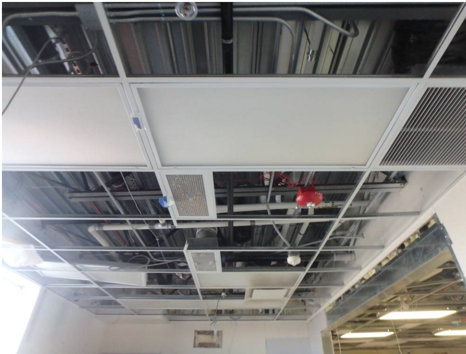
Alt. 1 Exam – Looking north - ceiling