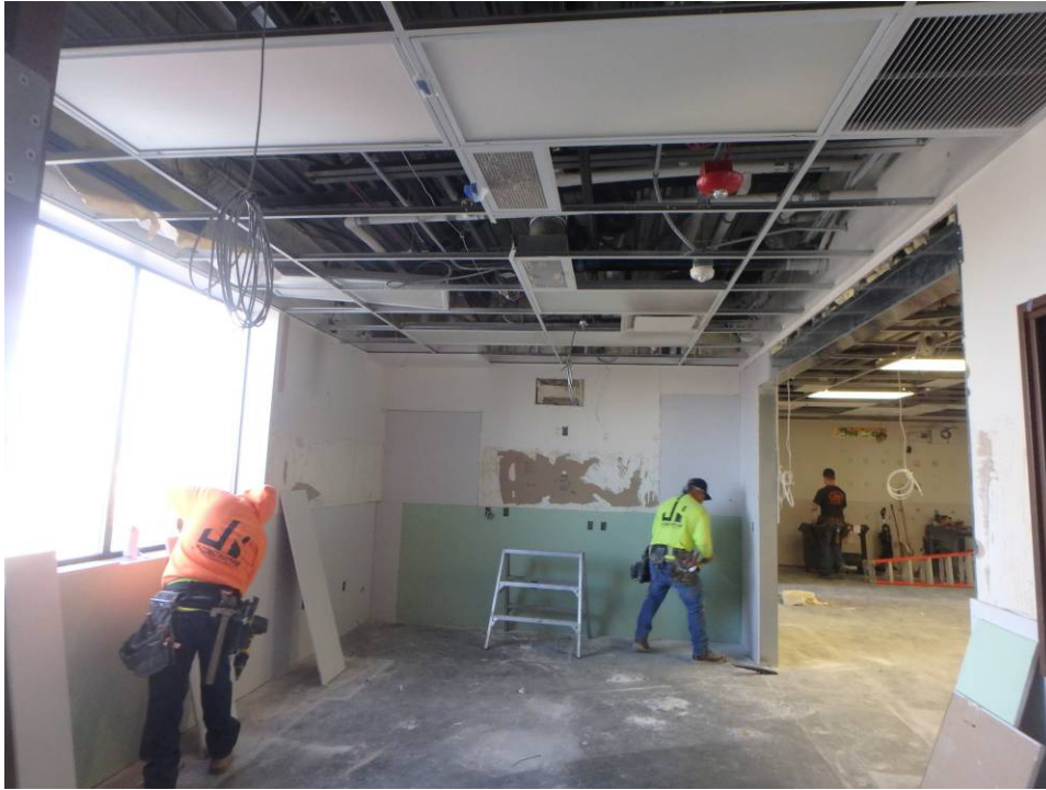
Alt. 1 Exam – Looking north