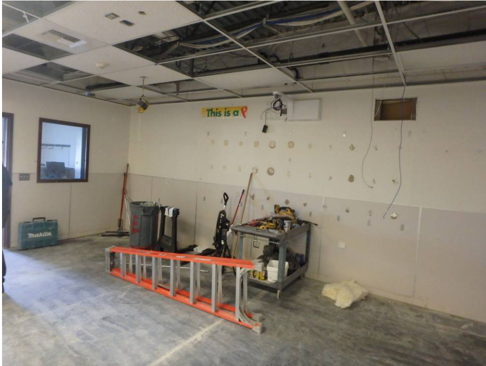
Alt. 1 main room north wall – projector