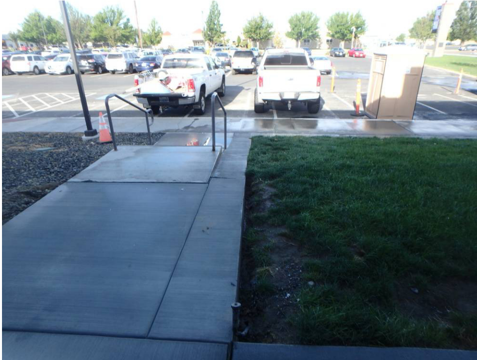
Cast sidewalk and mow strip