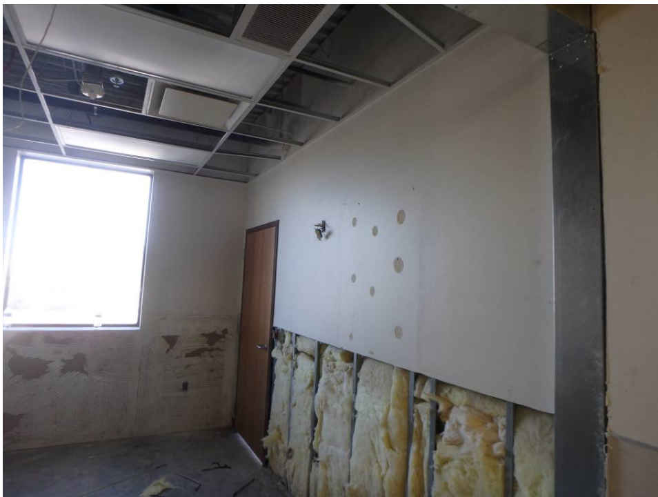
Alt 1 Looking at the north wall of the small exam room