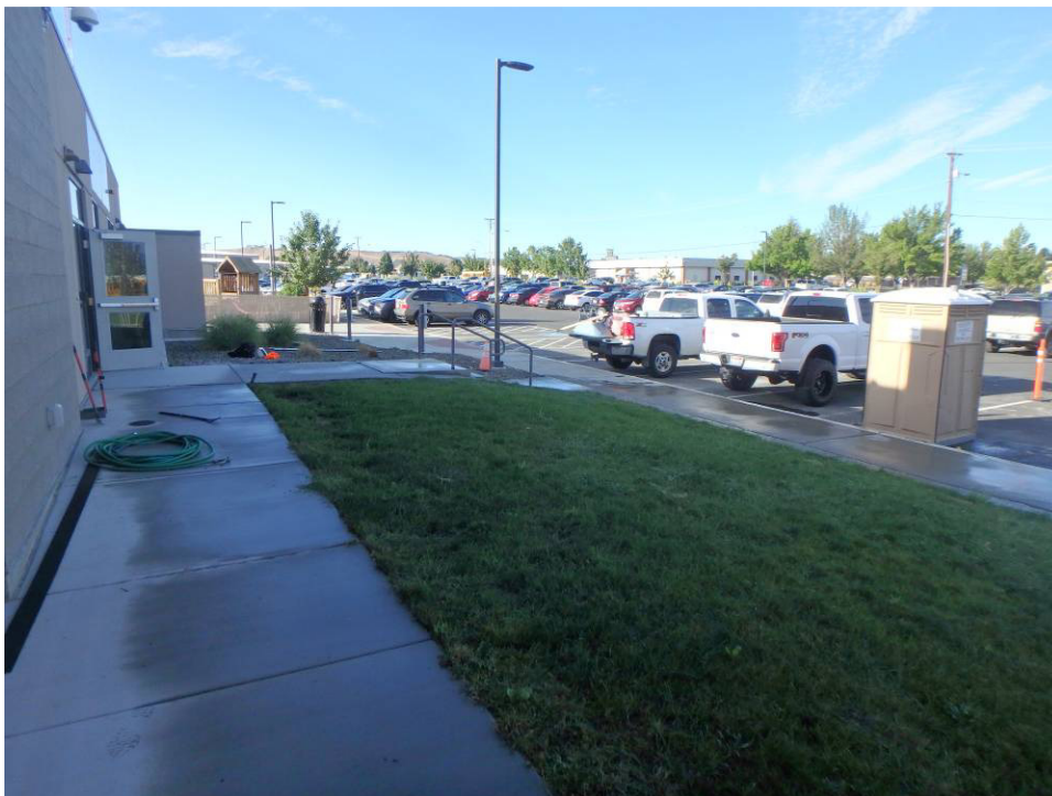
West grass area – looking south. Fencing removed and central mow strip removed and sidewalk is cast