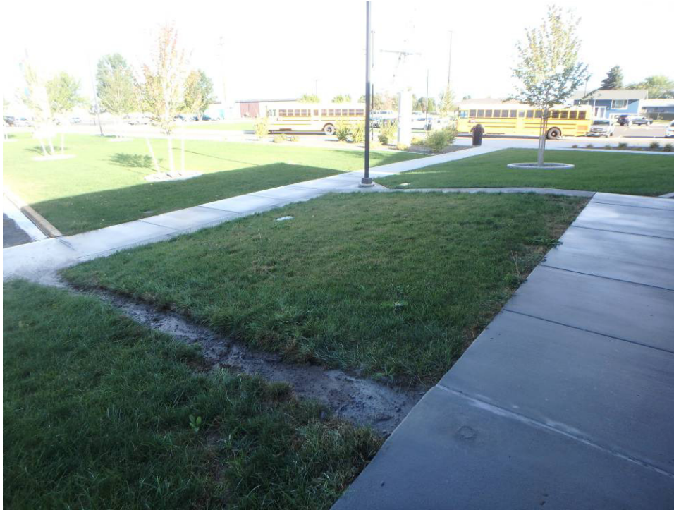
Mow strip removed