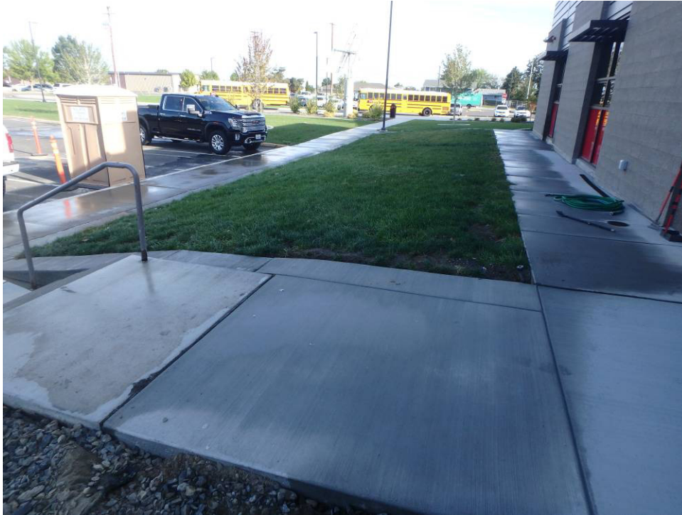
West grass area – looking north. Fencing removed and central mow strip removed and sidewalk is cast