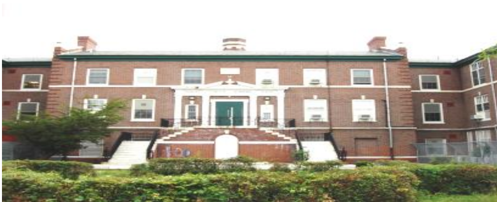
SCHOOL 25 287 TRENTON AVENUE PATERSON, NEW JERSEY 07503 (973) 321-0250