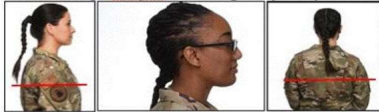
Unbraided Single Ponytail/Pull-through Ponytail Style/Braided Ponytail