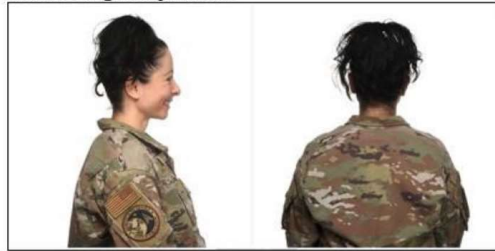
Ponytail Fasten on the Crown of Head.