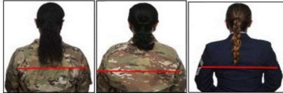
Unbraided Single Ponytail/Pull-through Ponytail Style/Braided Ponytail