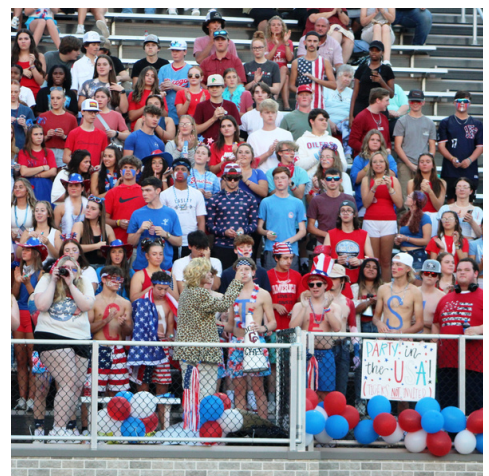
Above: The Cavalier Crazies were out in full force in red, white, and blue outfits, ready to engage their theme of "Party in the U.S.A."