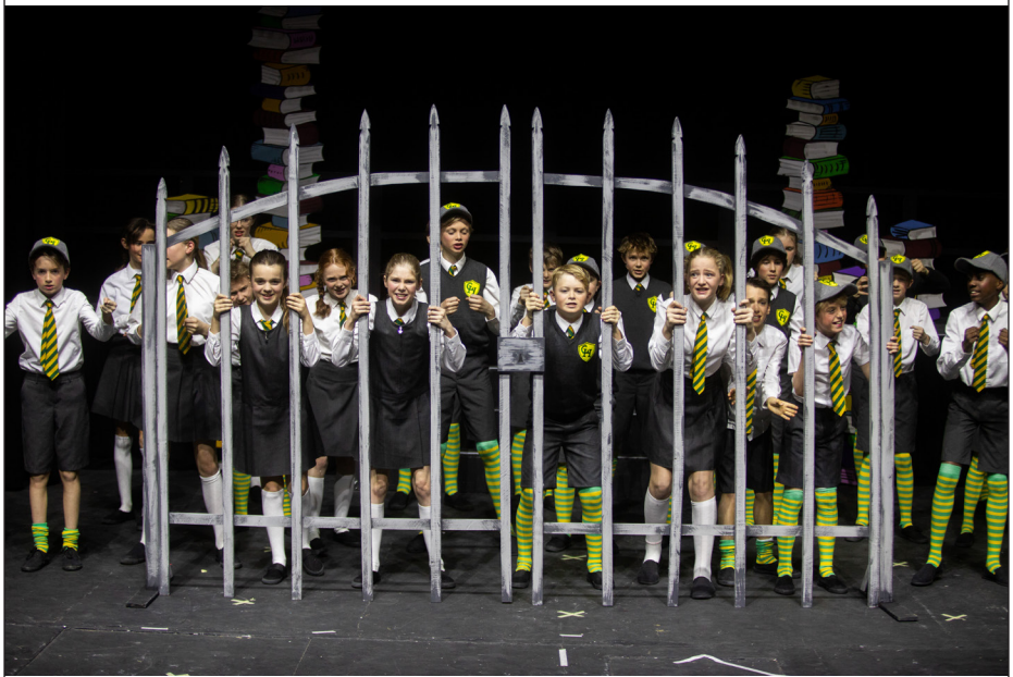
Year 7, Matilda 2023

A very warm welcome to St Hugh's Upper School awaits you!