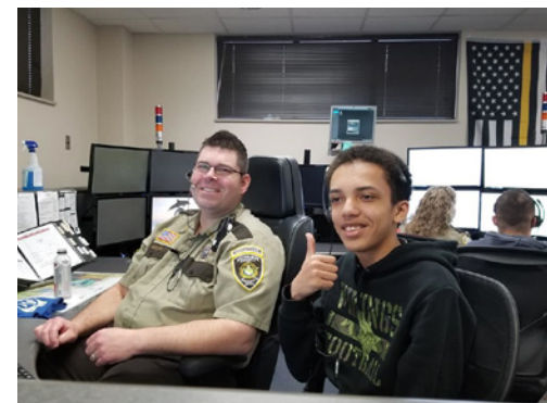
Students from Prairie View Middle School took part in a job-shadowing day at the Sherburne County Sheriff's Office.