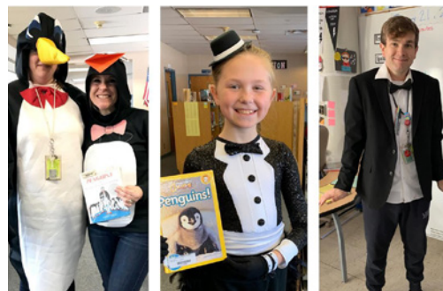
Celebrating I Love to Read Month went to the penguins, as Lincoln Elementary went wild for "Mr. Popper's Penguins."