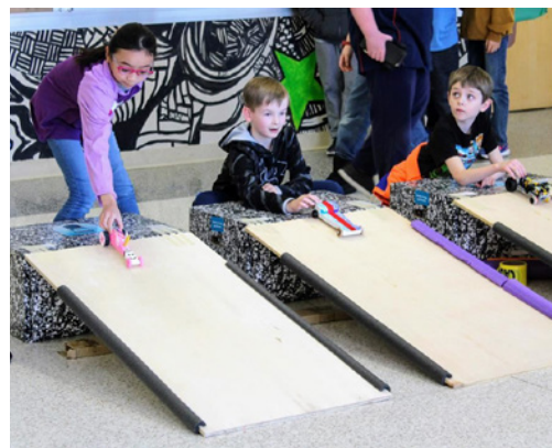
Fifth grade students at Westwood Elementary designed and raced derby cars to see which car would roll the farthest.