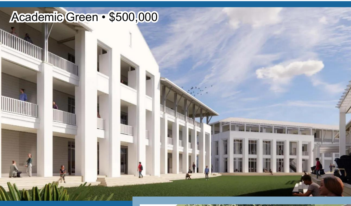
Academic Green • $500,000