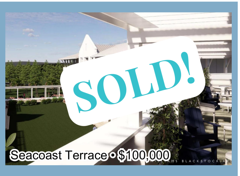
Seacoast Terrace • $100,000