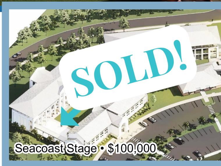
Seacoast Stage • $100,000