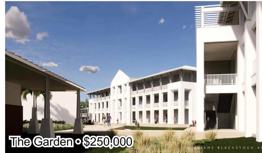
The Garden • $250,000