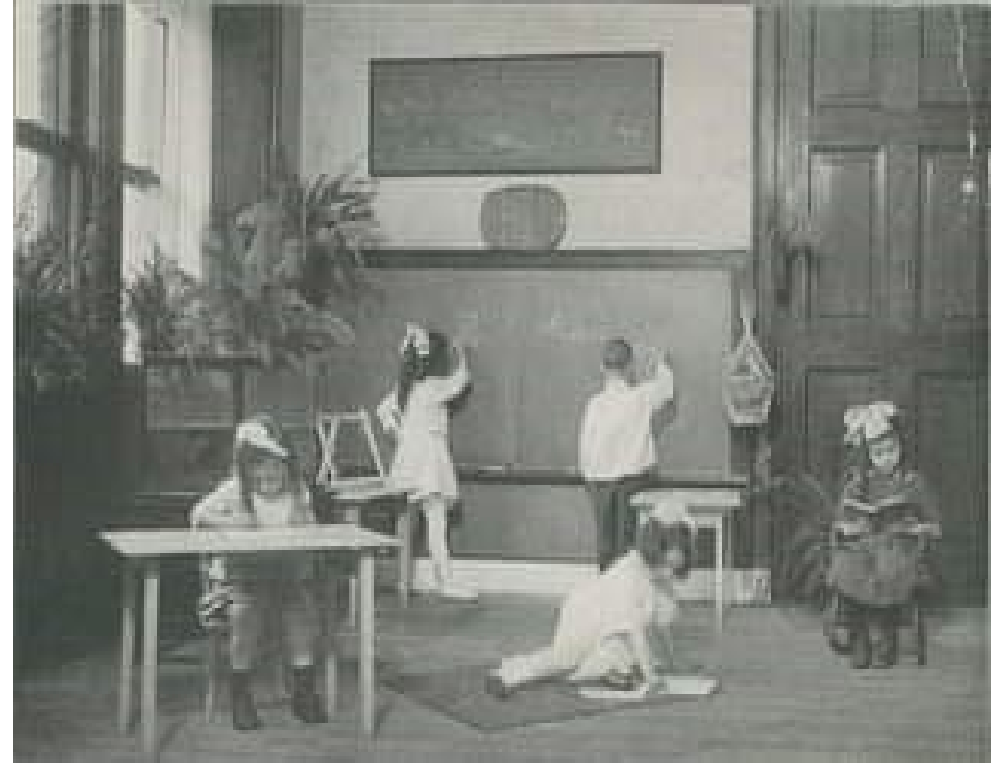
Students working individually.