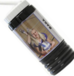
Photo Sports Bottle (Ind. and team photos & your name on insert. Storage compartment on the bottom!)