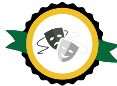
Fine & Performing Arts