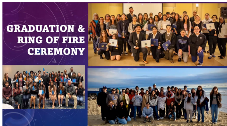
Future for Lompoc Youth graduating class of 2023