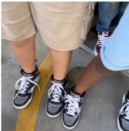
First Day of Kindergarten. A great opportunity to meet a new friend who likes the same shoes that you do!

Board members provided some immediate feedback and will continue to work to offer input.