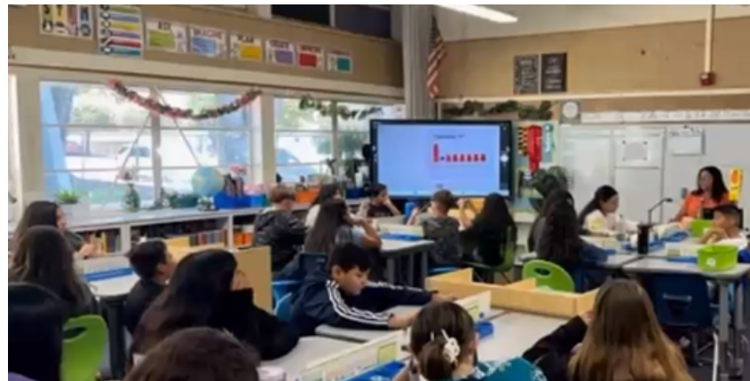
Hapgood Dual Immersion Classroom