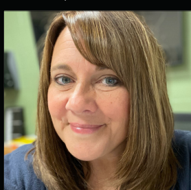
Gretel Lloyd Excellence in Education Award