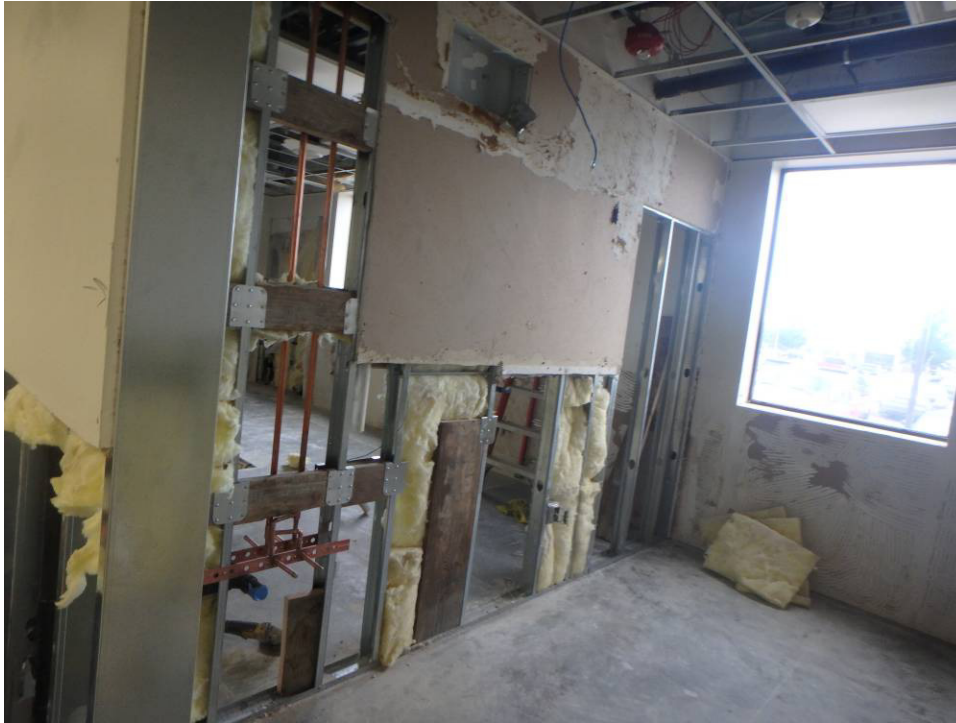
Alt. 1 Exam – Looking southwest