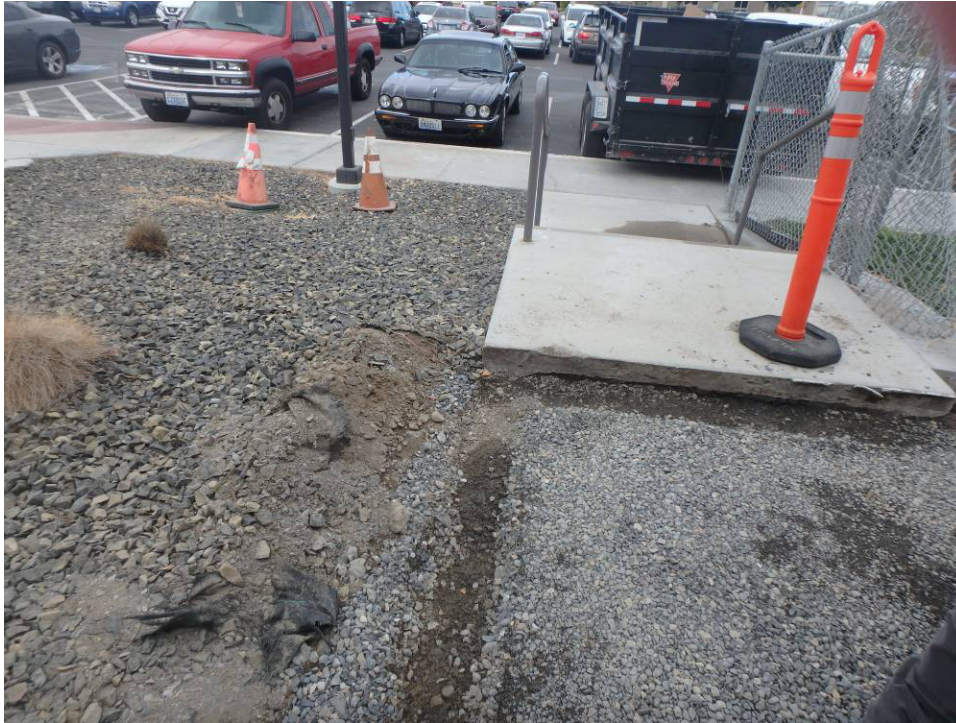
Demoed at the top of the stairs