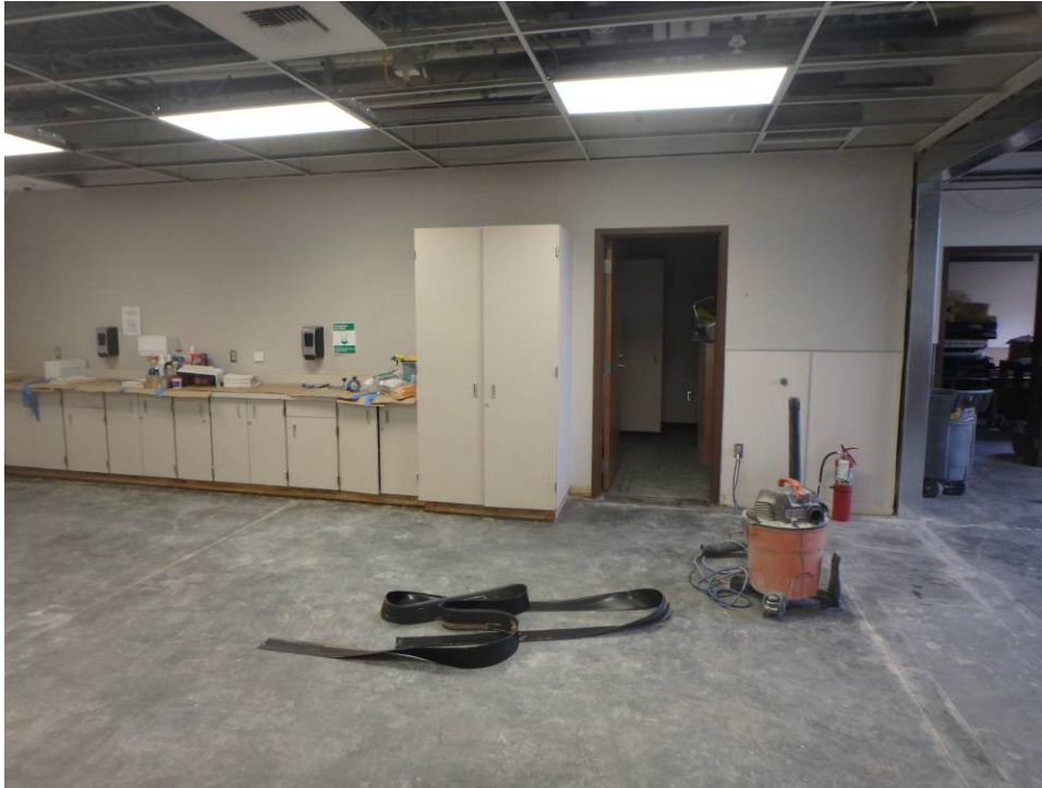
Alt. 1 main room south wall