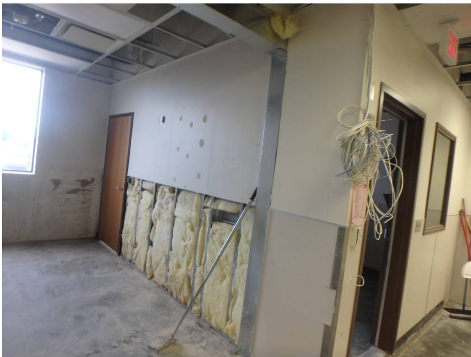
Alt. 1 Exam – Looking northwest