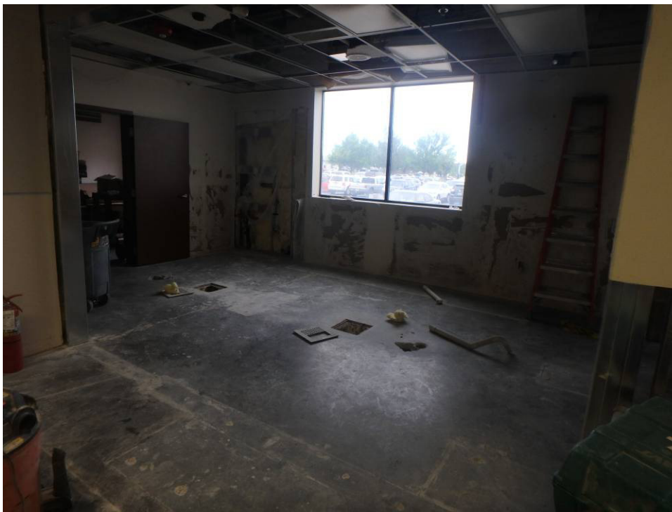
Alt. 1 Old kennel room west wall