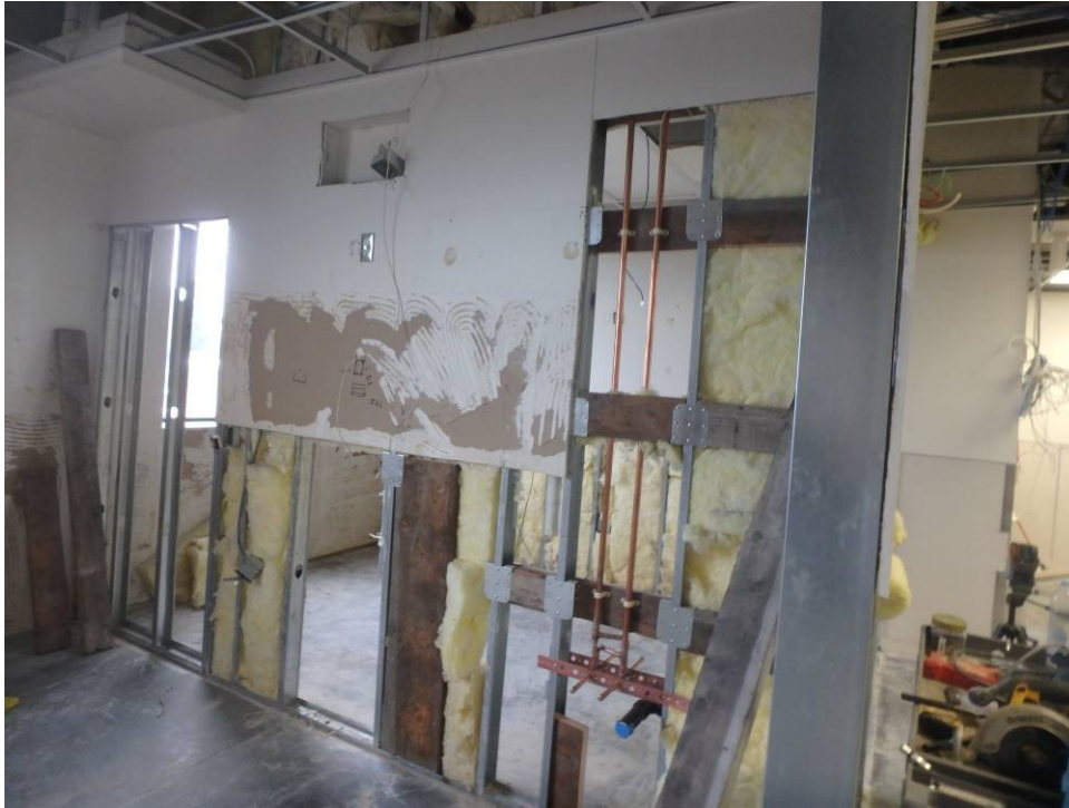
Alt. 1 Old kennel room north wall