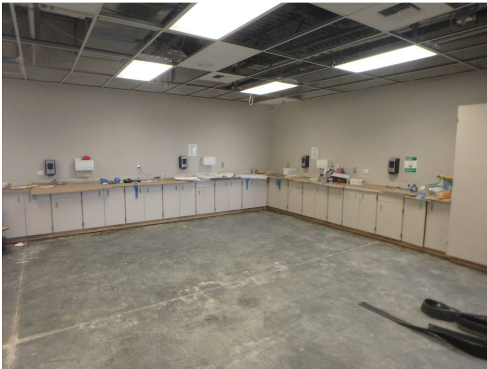
Alt. 1 main room southeast corner