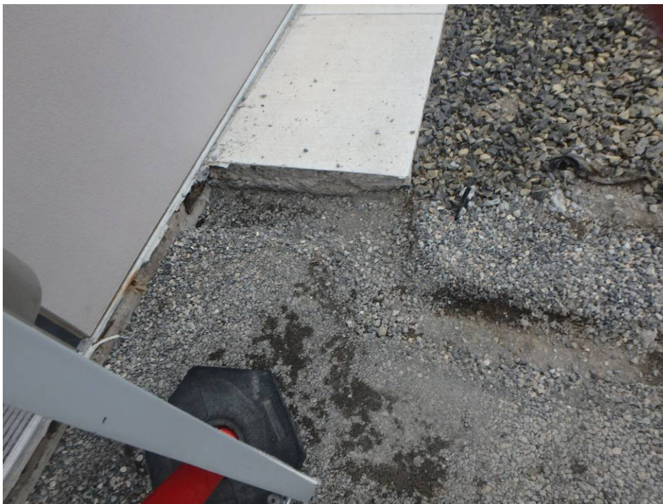
Alt. 1 Mow curb south of the main door