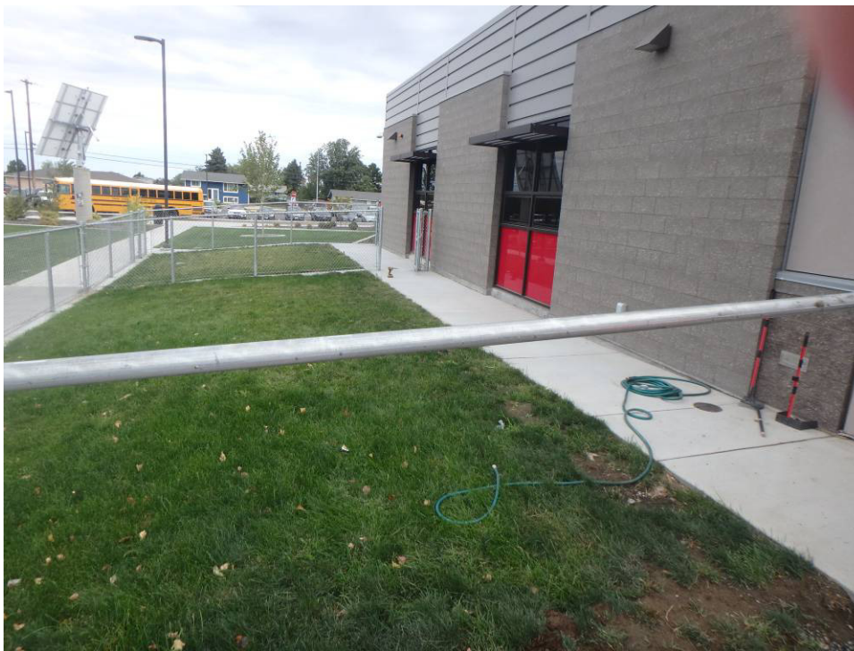
West grass area – looking north. Fencing and central mow strip to be removed.