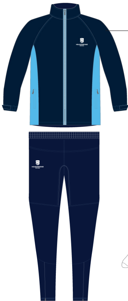
Navy tracksuit jacket, crested or Navy retro jacket, crested

Days with PHE Class and some Field Trips