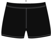
Navy or black cartwheel shorts