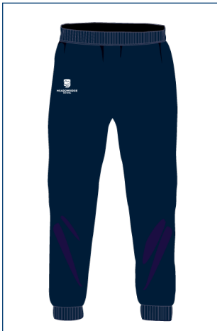
Navy tapered pants, crested or Navy cuffed sweatpants, crested