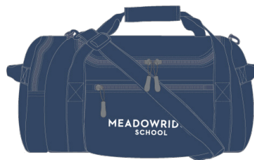
Gym bag, crested