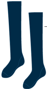
Navy knee socks, opaque, non-patterned or Navy tights, opaque, non-patterned