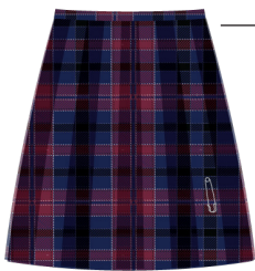
Tartan kilt with kilt pin