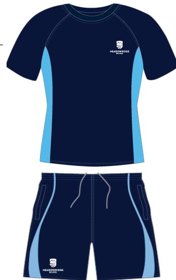
Navy athletic shorts, crested