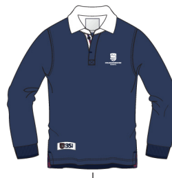
Rugby Shirt, crested