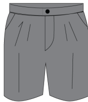
Grey school dress shorts