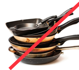
POTS, PANS, SCRAP METAL