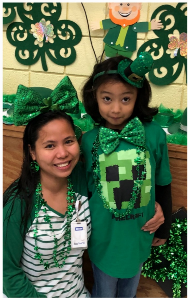
Students and staff and Dade Elementary go ALL out celebrating St. Patricks Day!