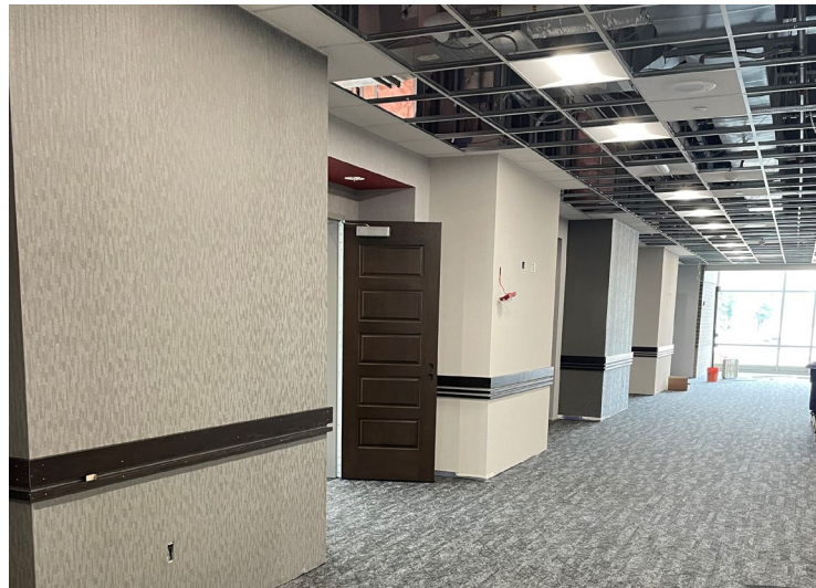
Board Room Entrances