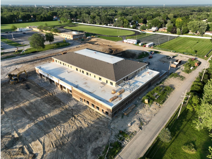
New Administration Building