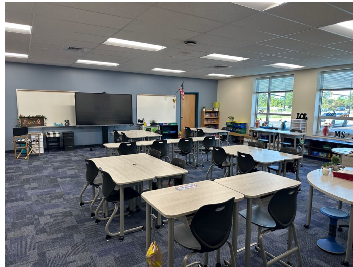
Classroom Addition New Room