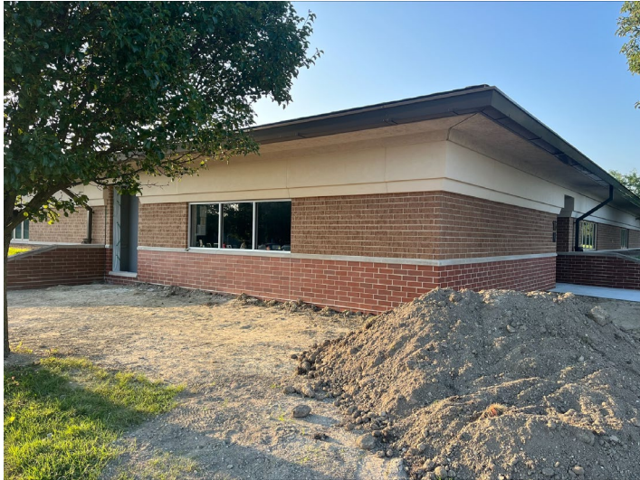
Classroom Addition Exterior