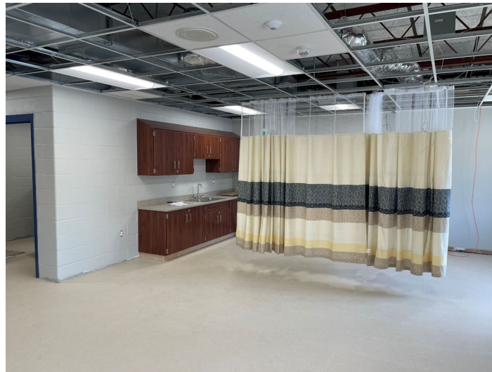
Alt. Ed. Nurses Room