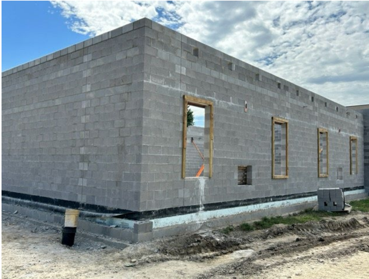
New Classroom Addition