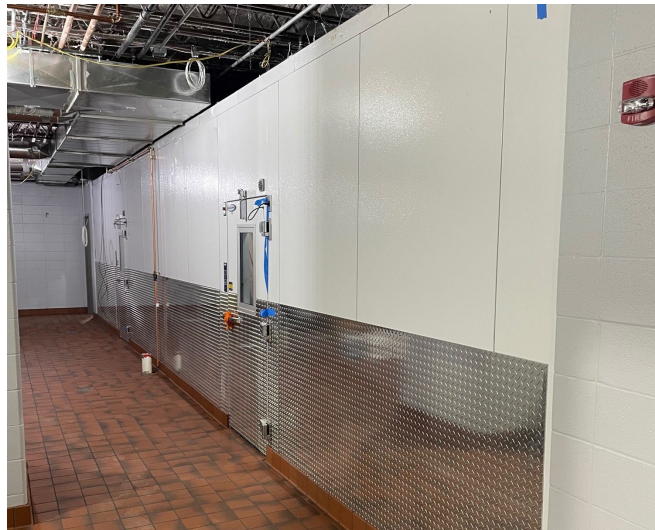
Admin Renovations Main Desk