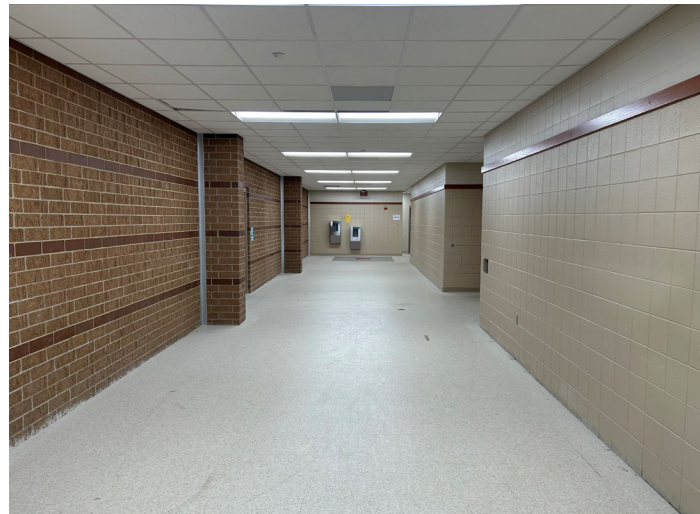
Unit A Classroom Addition