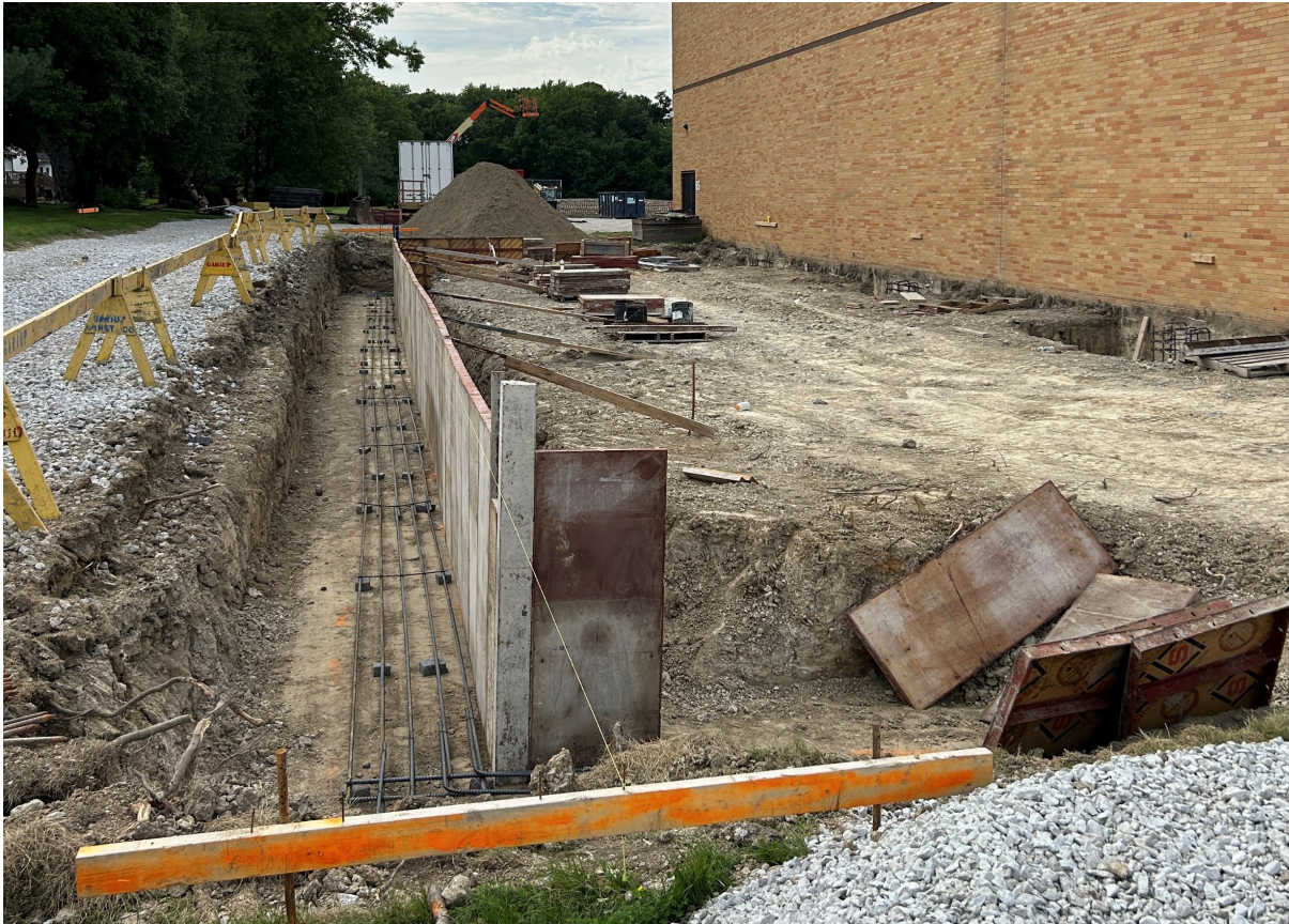
Classroom Addition Concrete Footing