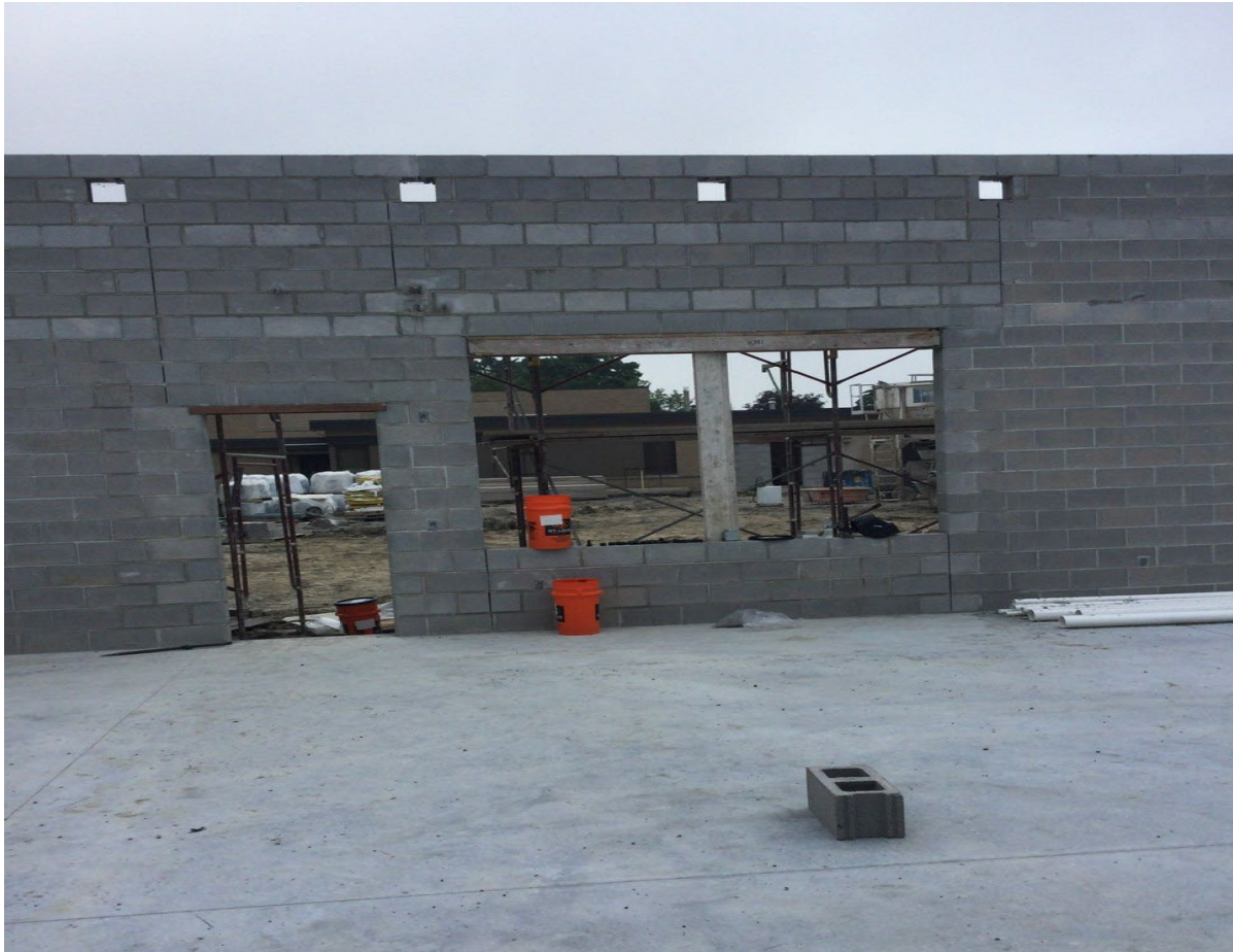
Media Center Addition within Courtyard