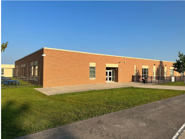
New Classroom Addition