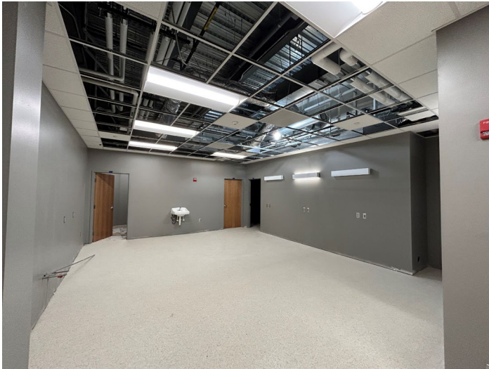
Exceptional Learners Classroom