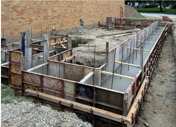
Stage Addition Concrete Footings