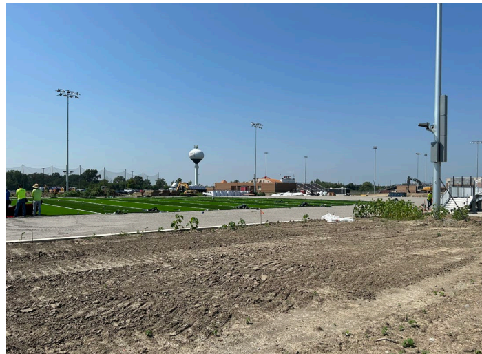
Athletic Field Turf Installation