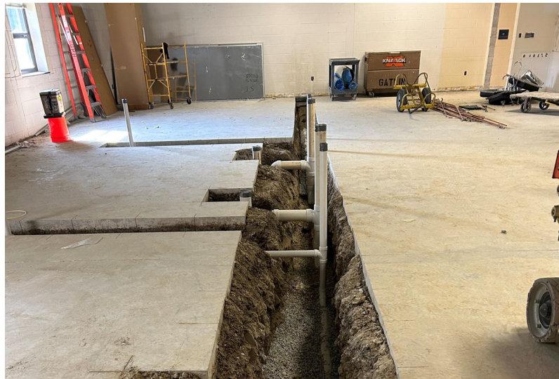
Pre-K Rooms Underground Utilities