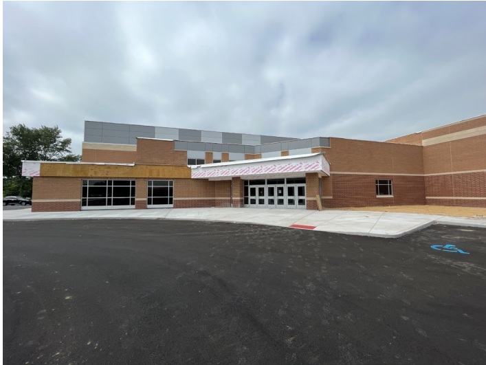
Auditorium Addition Main Entrance