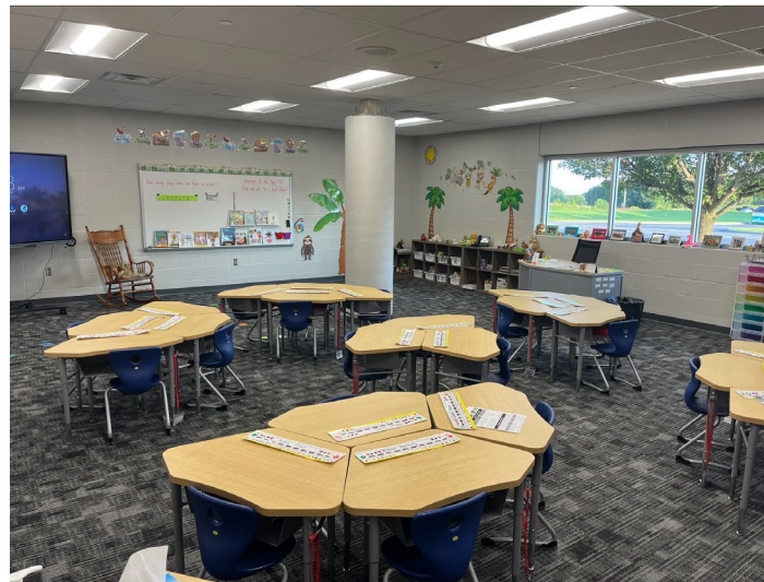
Classroom Addition Interior