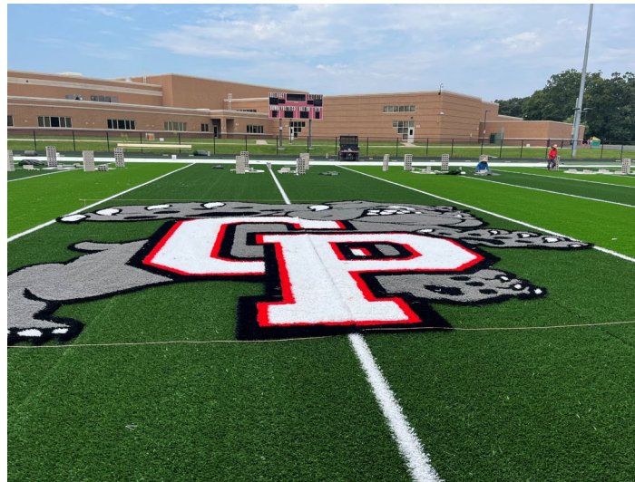
Turf Field Logo