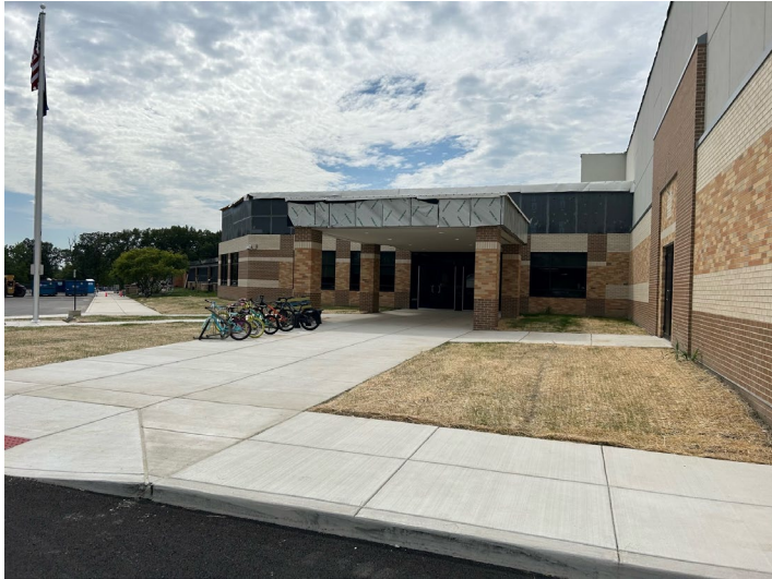
New Main Entrance