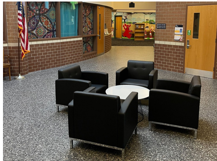
Main Entrance Renovation