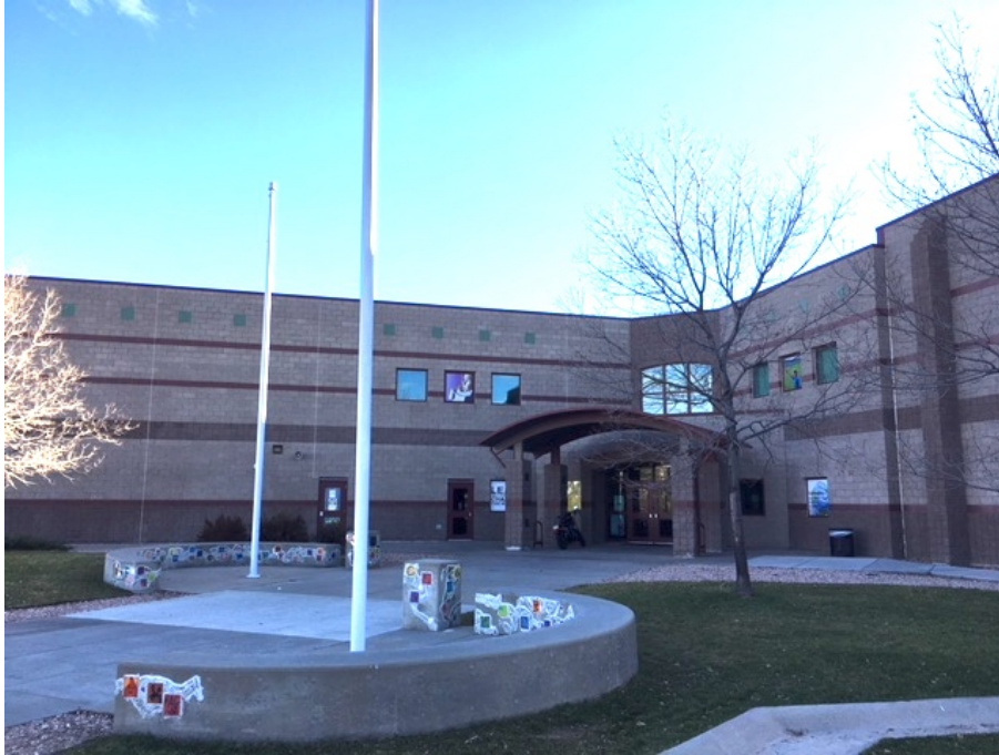
Figure 2 – Trailblazer Elementary

Much success is possible when districts establish school-based identities and assign marketing resources to schools and not an overall district identity that might be hampered by reputations or incidents completely unrelated to individual schools. Marketing consultants and stand-alone websites are among the considerations that can assist individual schools. Principals, teachers and office staff can all be trained to be advocates and sale people for their buildings. Many charters train staff in this regard in order to attract and retain enrollment. Brochures and individual-school-specific promotional material should also be dependably available. Concentrating individual school web presence on central district websites creates a confused message for many parents. Website technologies can just as easily create individual school websites on centralized web servers without emphasizing the overall district identity.