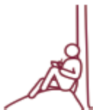
Tales in the Palm of your Hand: A Creative Writing Journey!