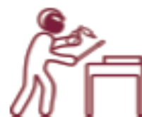
Intro to Metalsmithing

*Registration Fees for GEAR UP (10th & 11th) students are PAID BY FWCS's K-12 COLLEGE AND CAREER READINESS/GEAR UP Office