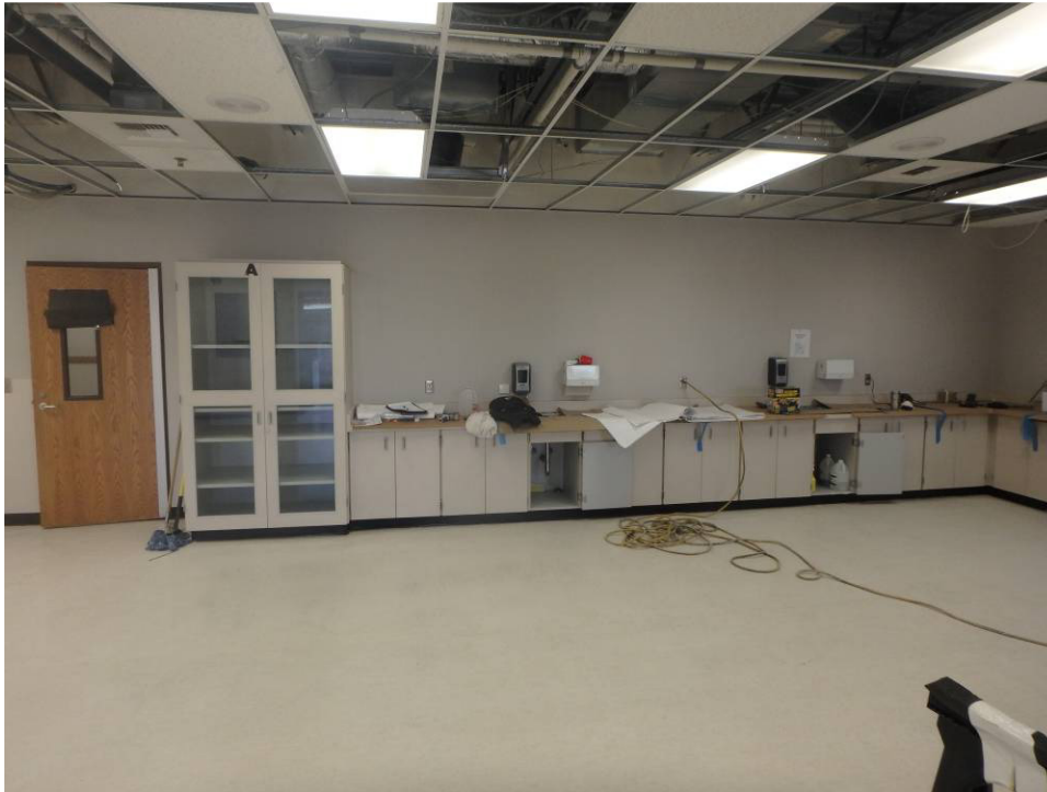
Alt. 1 main room east wall