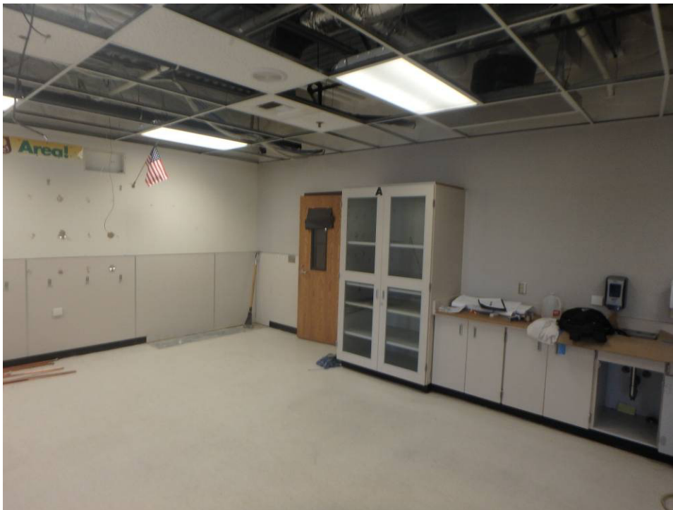
Alt. 1 main room northeast corner