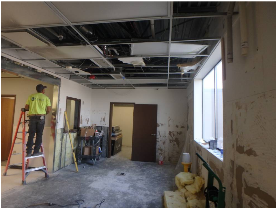
Exam 2 – south wall and new header over opening into the main room (left)