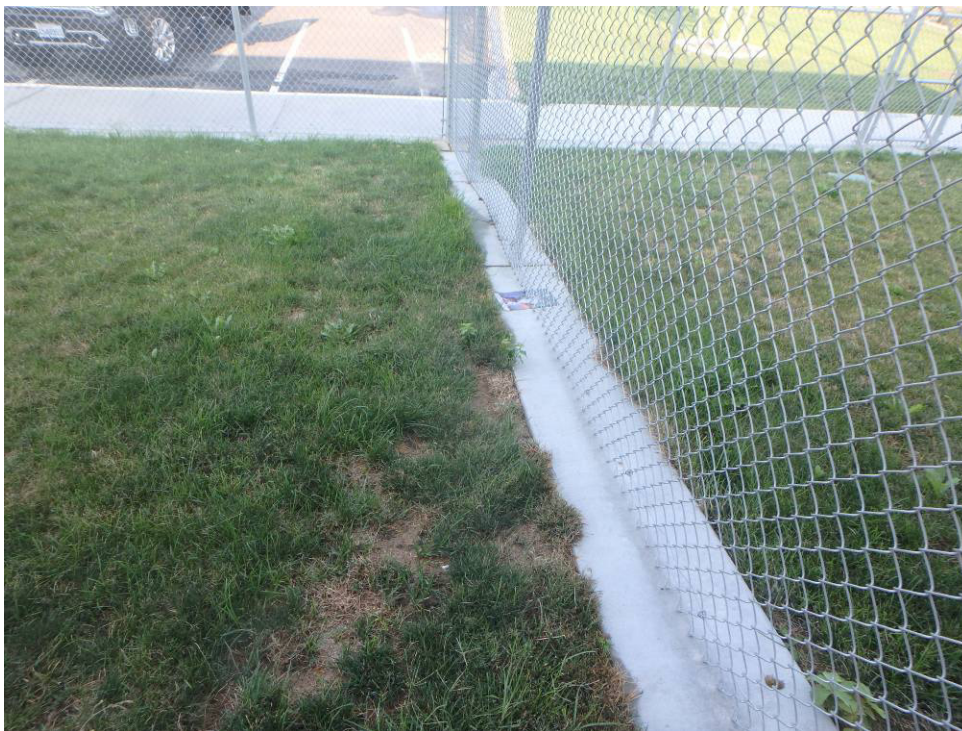
Central mow strip to be removed