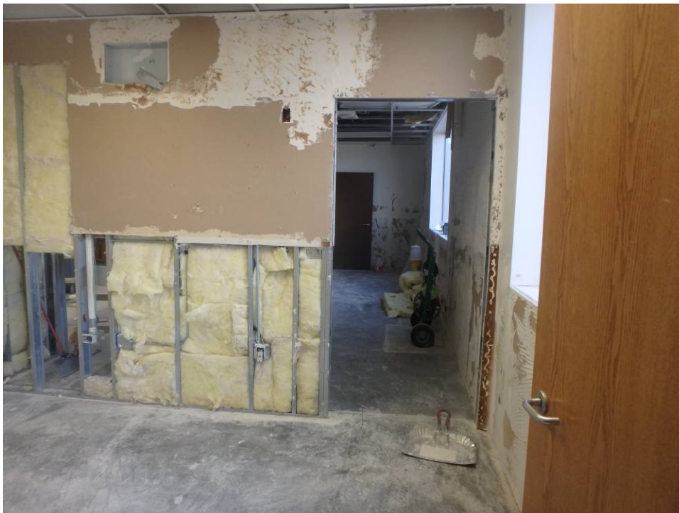
Exam 1 - old south wall