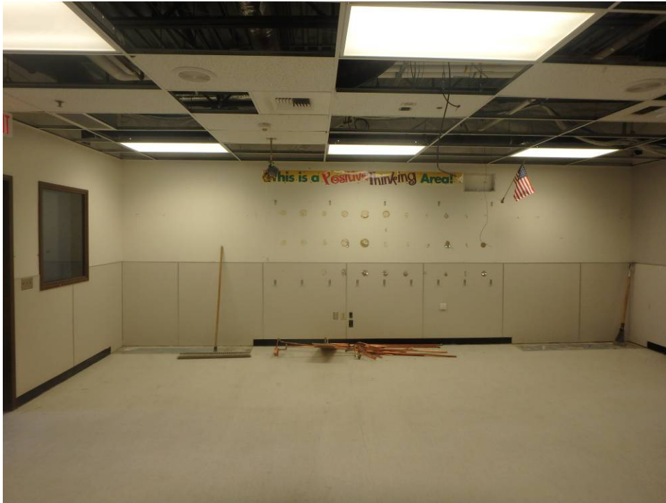
Alt. 1 main room north wall