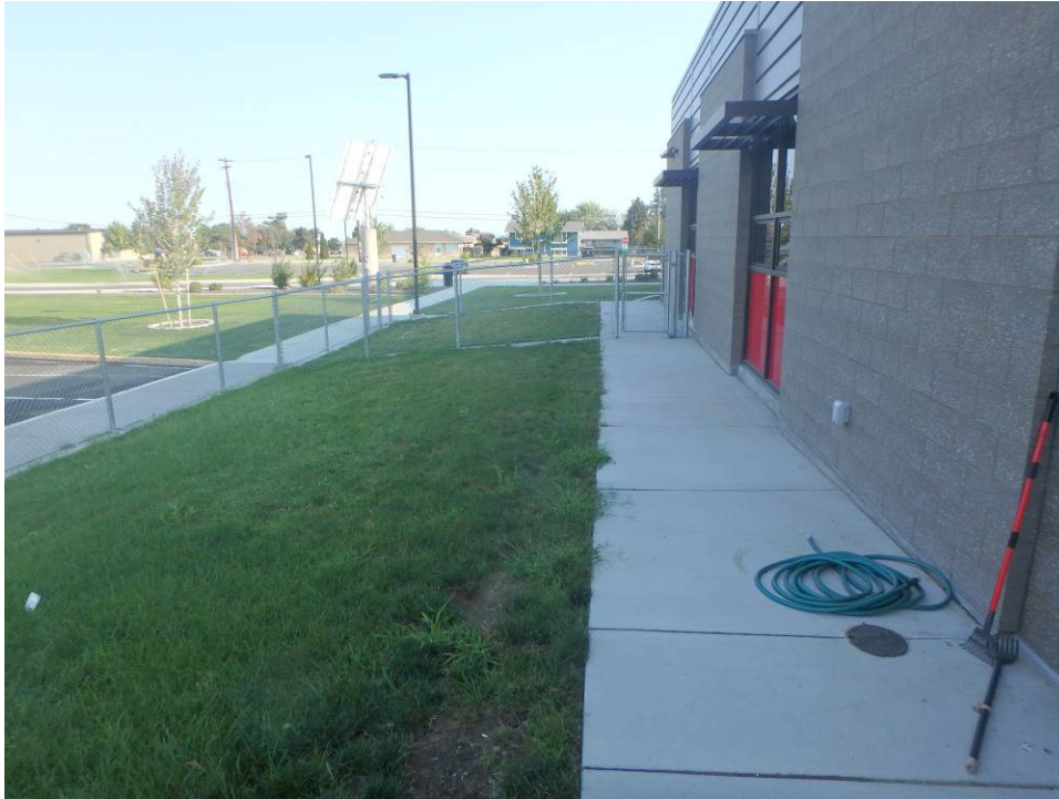
West grass area – looking north. Fencing and central mow strip to be removed.