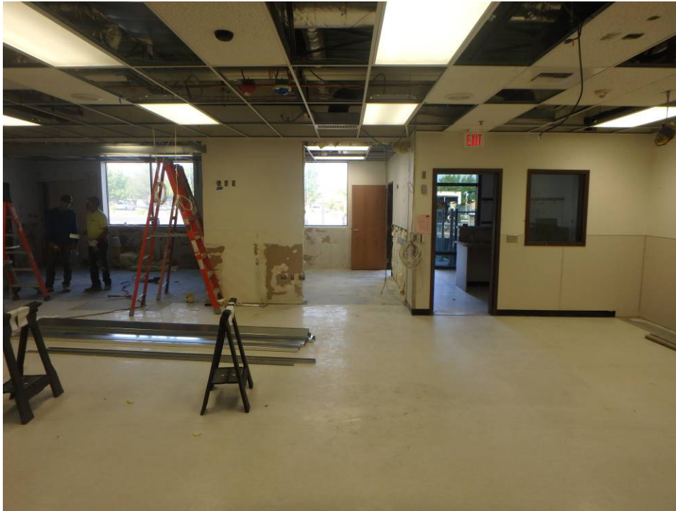
Alt. 1 main room west wall