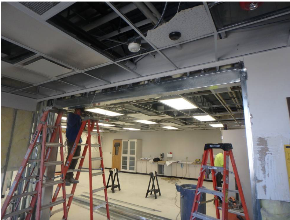
New headered opening into main room