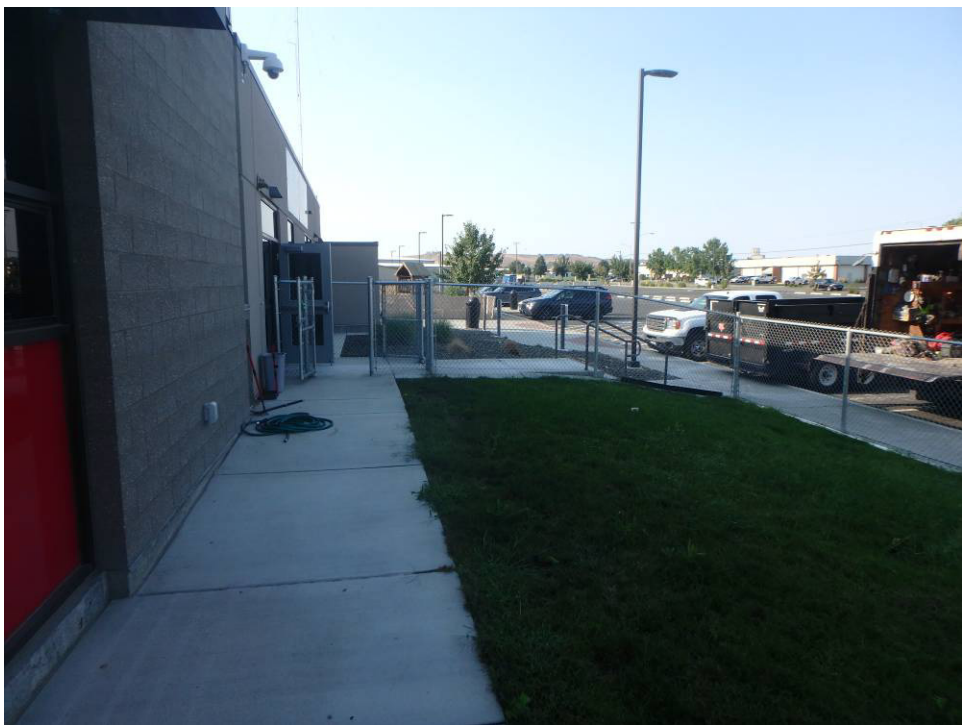
West grass area – looking south