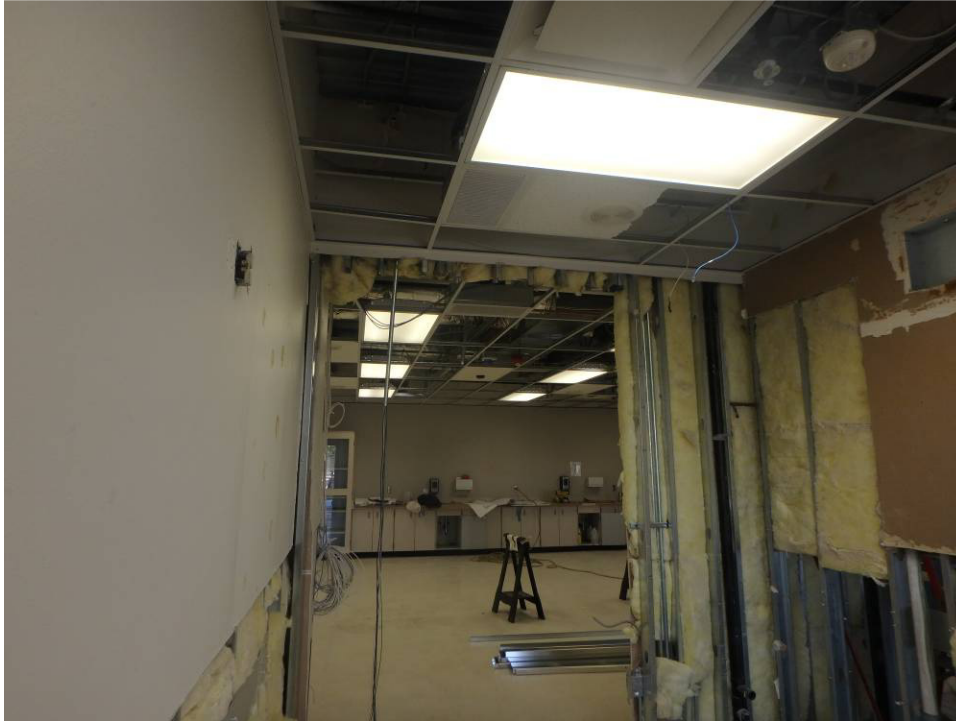
Exam 1 – old east wall now open to main room