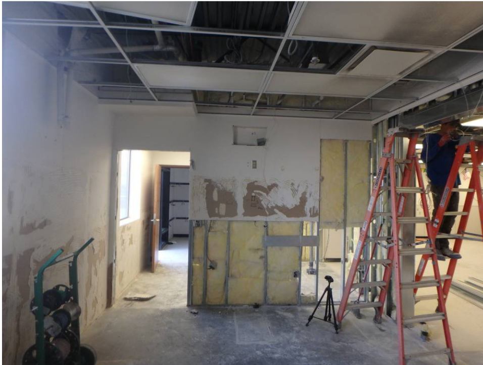
Exam 2 – Looking north