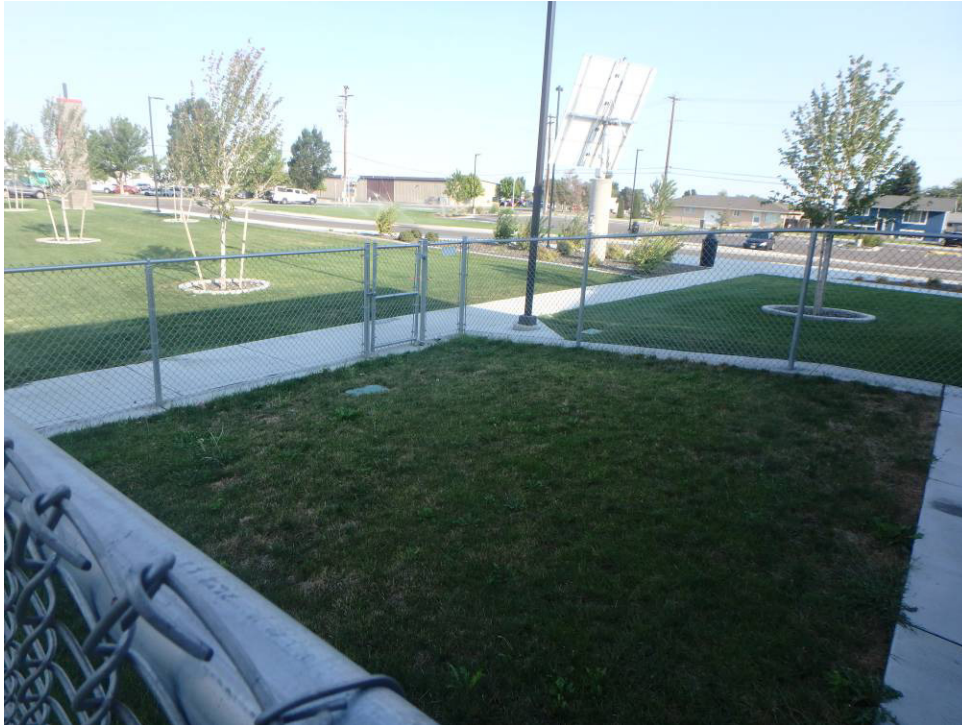
West grass area – north half and fencing to be removed all around