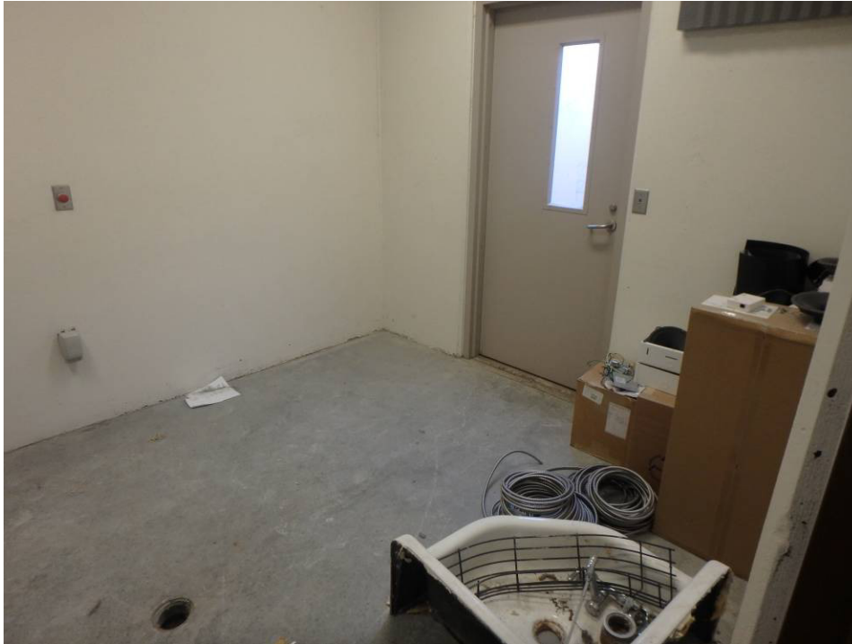
Old kennel room exterior door in west wall