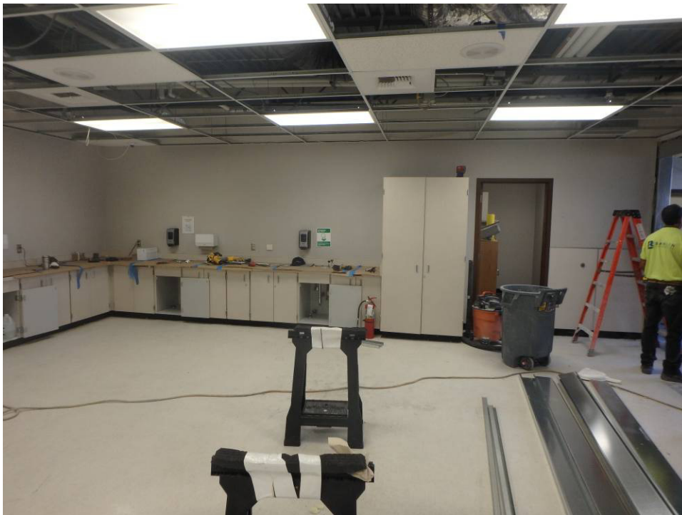
Alt. 1 main room south wall