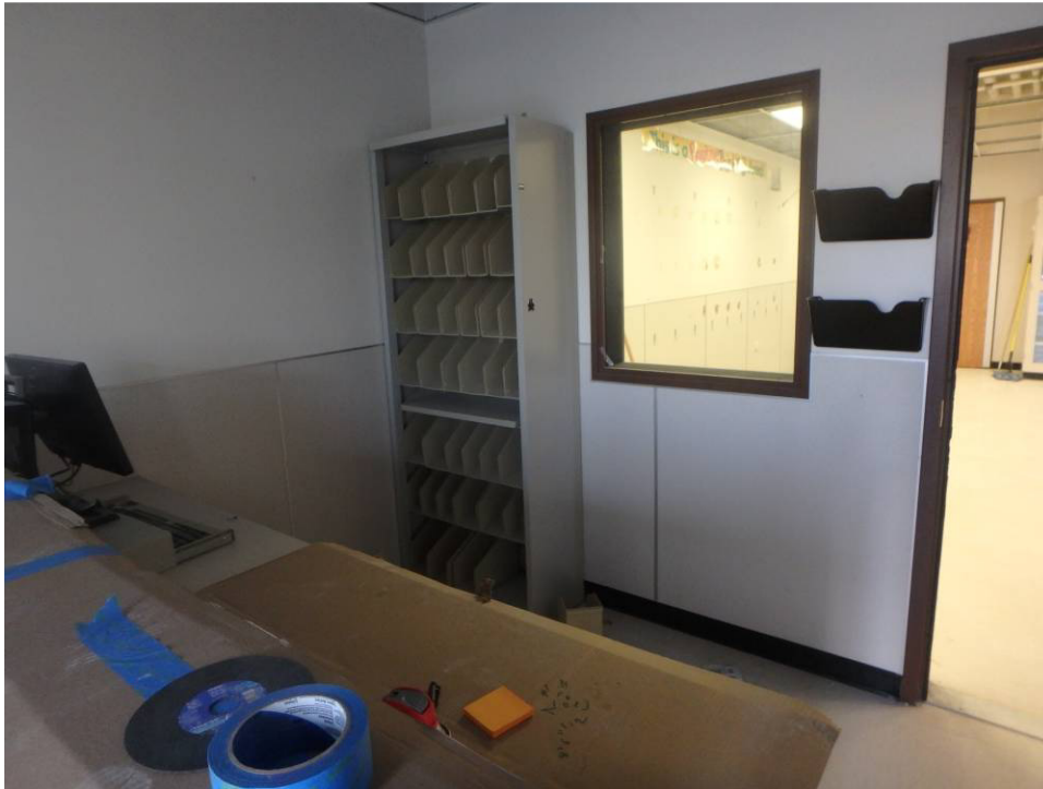
Reception desk, northeast corner