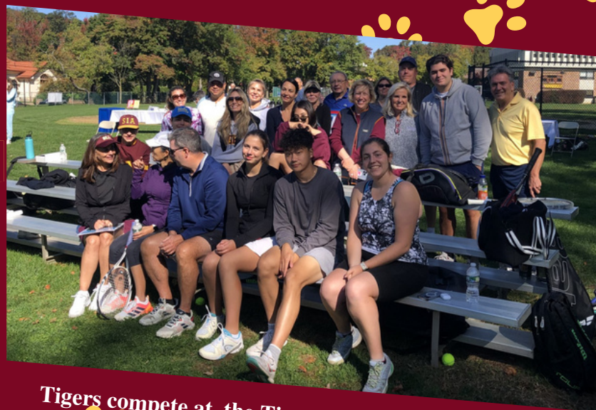
Tigers compete at the Tiger Tennis Tournament 2023