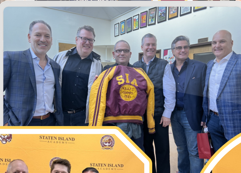
1981 Boys Varsity Soccer Team