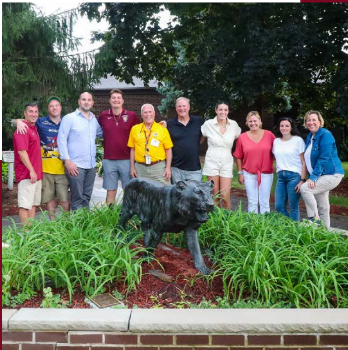
SIA Alumni Faculty Members #OnceATigerAlwaysATiger